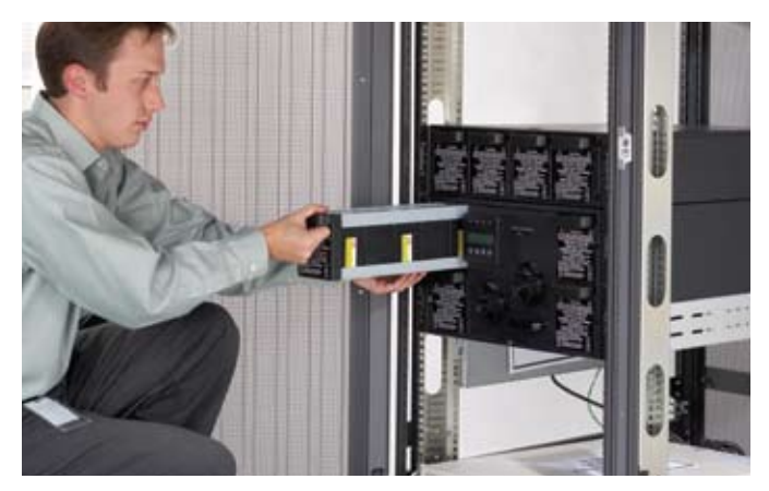
Modular, lightweight design allows for easy installation and service.