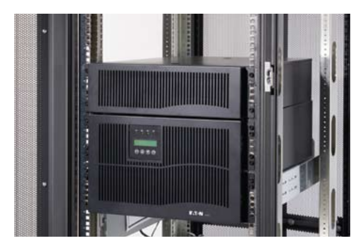
The 9140 and one EBM occupy only 9U of rack space.