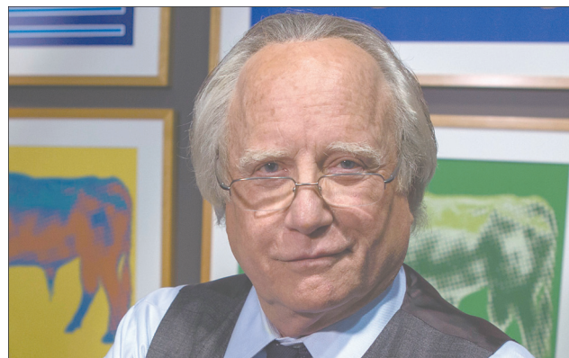
Richard Dreyfuss stars in "Madoff"

Peter Scolari ("Newhart") plays Madoff's brother, Peter, senior managing director and chief compliance officer at the firm. Peter allowed himself to get wrapped up in the scam, falsifying the company's accounts, and was sentenced to 10 years in prison.