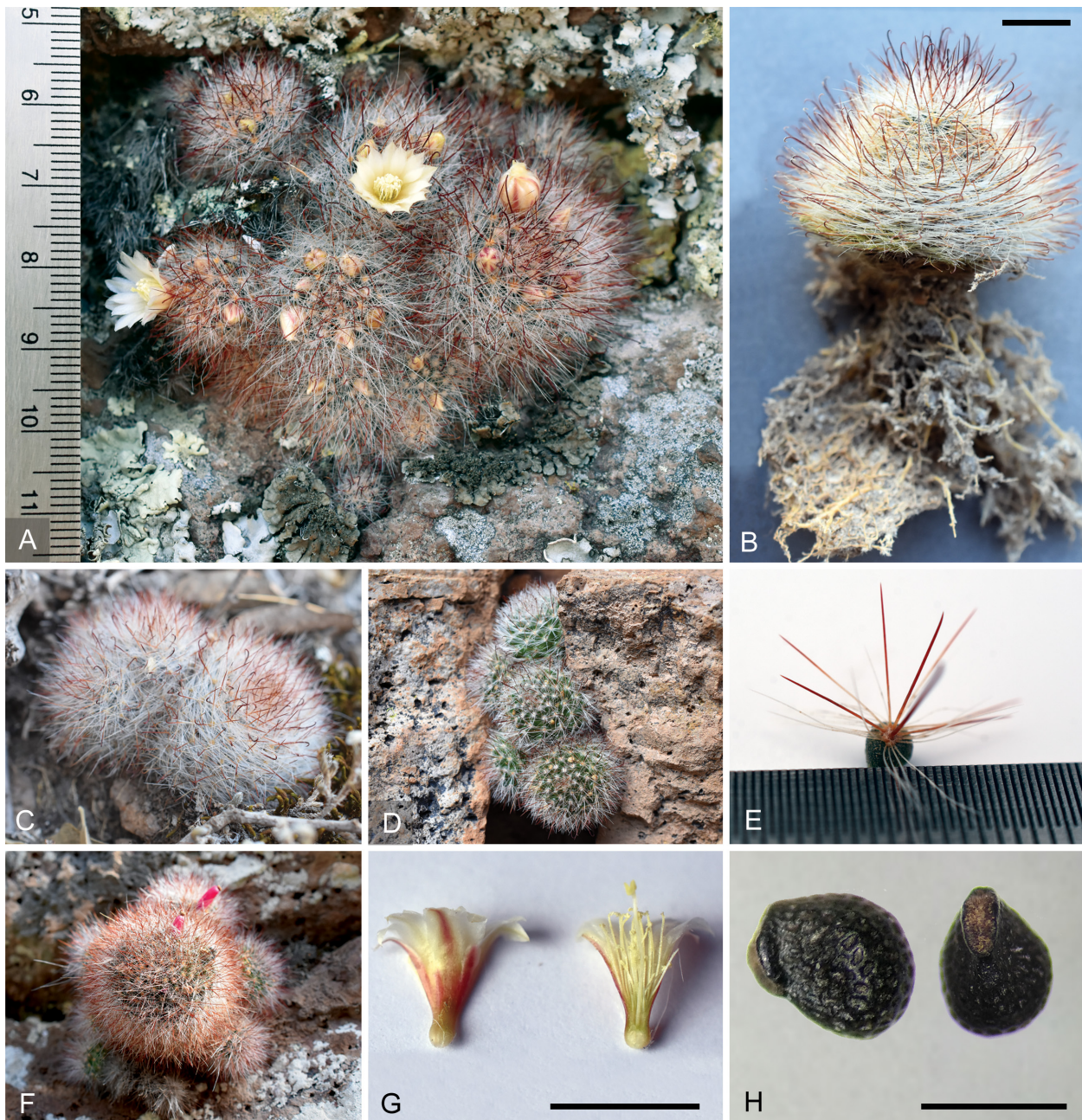
Fig. 3. Morphology of Mammillaria morentiniana during dry and rainy seasons. – A: plant flowering in habitat; B: stem and roots; C: stems during dry season covered by radial spines resembling white needle-bristles; D: stems during rainy season showing hydrated and expanded tubercles; E: close-up of tubercle and areole bearing six central spines; F: plant bearing red and claviform fruits; G: flower in longitudinal section, outside and inside views; H: seeds. – Scale bars: A = primary graduations of 1 cm, secondary graduations of 1 mm; B = 10 mm; E = graduations of 0.5 mm; G = 10 mm; H = 1 mm.

0.7(–9.2) mm long, glabrous. Flowers infundibuliform, 7–9 mm long; outer tepals pale yellow with reddish middle stripe, lanceolate, margin entire; inner tepals pale yellow, lanceolate, margin entire; filaments pale yellow; anthers yellow; style pale yellow; stigma pale yellow, 4-lobed. Fruit pink, claviform, 10–20 mm long; seeds black, c. 1.1 mm in diam.; aril absent; testa pitted.