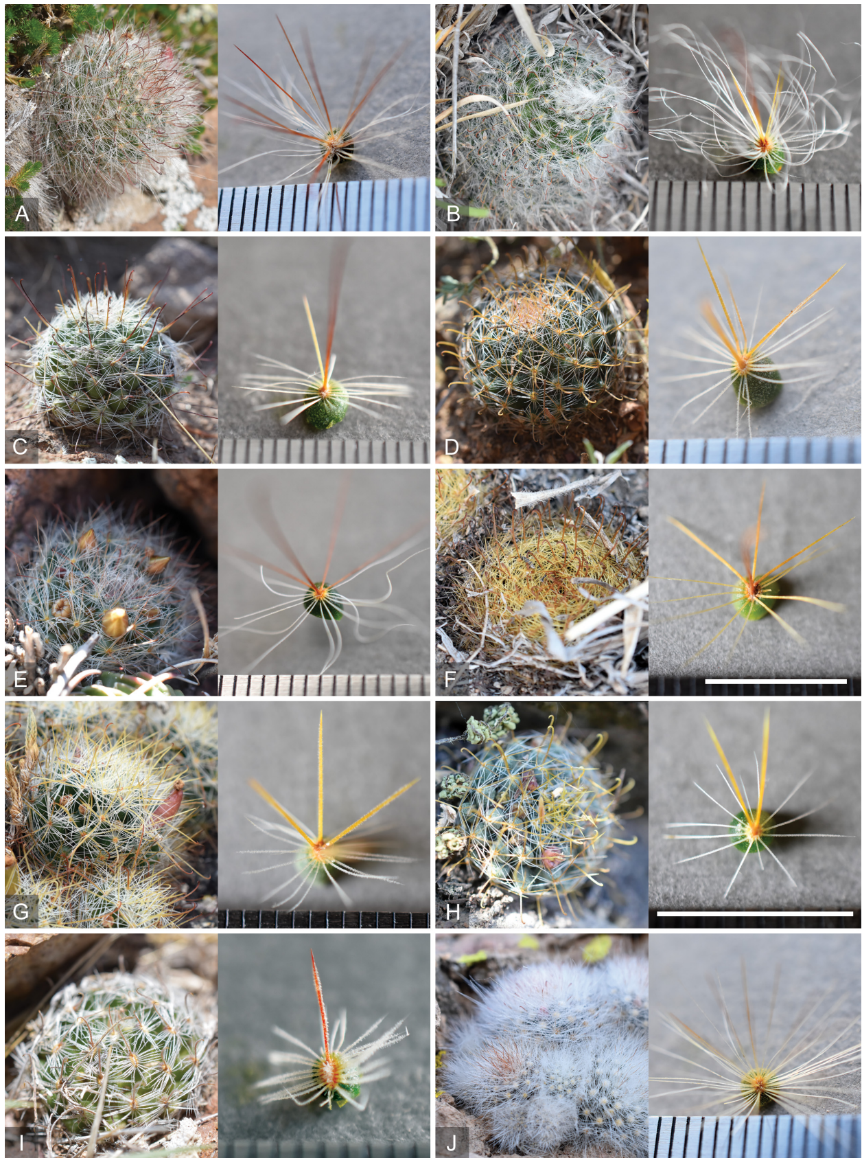
Fig. 2. Comparison of the stem (left), areole, central and radial spines (right) in the populations of Mammillaria ser. Stylothelae included in the analysis. – A: Mammillaria sp.; B: M. bocasana (bocasana_SLP); C: M. bocasana (bocasana_SLP2); D: M. crinita (c_crinita_QRO); E: M. crinita (c_crinita_QRO2); F: M. crinita (c_crinita_GTO); G: M. crinita subsp. leucantha (c_leucantha); H: M. crinita subsp. wildii (c_wildii); I: M. nana (nana); J: M. schwarzii (schwarzii). – Scale bars: A–E, G, I, J = graduations of 1 mm; F, H = 10 mm.