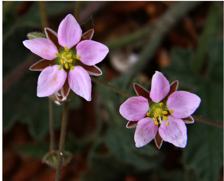
Fig. 1. Flowers of Rhodalsine geniculata from Spain, Lagunas de La Mata, Torrevieja, April 2012