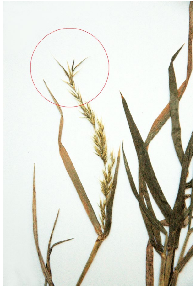
Fig. 4. Trisetum tamonanteae – panicle with a proliferated spikelet (‘‘plantlet’’), as a possible pseudoviviparous mechanism. – Paratype: A. Marrero (LPA 24805).

In the Poaceae pseudoviviparism has been recorded for at least 41 species in 13 genera (Pierce & al. 2003). It has been described for genera such as Dactylis L., Deschampsia P. Beauv., Digitaria Haller, Festuca L., Poa L., and Polypogon Desf., among others (Vega & Rúgolo de Agrasar 2006). The pseudoviviparism mechanism is generally associated with boreal or alpine species exposed to strong stress in nutrient-poor habitats (Elmqvist & Cox 1996; Pierce & al. 2003). The possible tendency to vegetative propagation by pseudoviviparism in T. tamonanteae