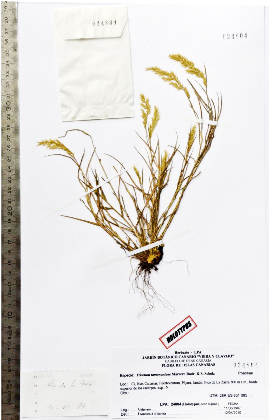
Fig. 1. Holotype of Trisetum tamonanteae – A. Marrero (LPA 24804).