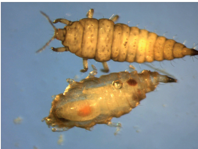
Fig. 1. Two immatures of Gynaikothrips uzeli : the upper individual is a normal larva, and the lower one displays the transparent, swollen appearance of a parasitized larva. The parasitoid, Thripastichus gentilei , develops with a polarity that is reverse relative to the host.

For experiments with T. gentilei , cuttings were sorted into replicates so that cuttings within a replicate had a similar number of eggs. Within a replicate, cuttings were randomly assigned a life stage treatment (1st instar, 2nd instar, prepupa, pupa I, and pupa II) similar to that of Tavares et al. (2013). To achieve uniform life stages, immatures were allowed to develop from eggs inside leaf galls to a certain stage; then all individuals not at that prescribed stage were destroyed. However,