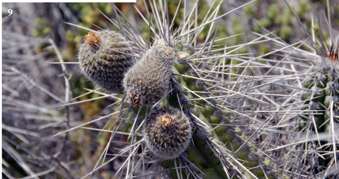
9 These images of Eulychnia chorosensis were taken on 6 November 2006 at Punta Choros, and show the bristly hypanthium.

the rank of species, when he described Eulychnia procumbens for a quite different plant. Backeberg (1977, Fig. 114) reproduces a good photo of his Eulychnia procumbens . It is believed to be a small growing form of Eulychnia breviflora similar to those found near Bahía Inglesa and illustrated by Leuenberger & Eggli (2000, Fig. 12). It was dismissed by Ritter as a synonym of Eulychnia breviflora .