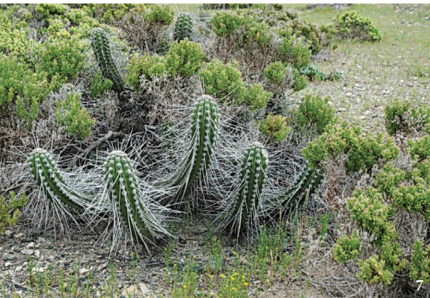
6 A seedling of Eulychnia taltalensis , PH255.02, from the coast between Punta Plata and Paposo, at 40m, in cultivation, displaying the brown areole felt. 7 Taken on 21 October 2004 in the Llanos de Choros, this picture captures the first time that the author (PK) observed Eulychnia taltalensis in habitat and started the search for its identity.

suiting to higher levels of moisture availability and has displaced Eulychnia iquiquensis (Figures 3, 4). Eulychnia iquiquensis is the most drought resistant member of the genus and perhaps less suited to wetter conditions. An alternative theory is that Eulychnia taltalensis is of hybrid origin between Eulychnia iquiquensis and Eulychnia breviflora and it has hybrid vigour.