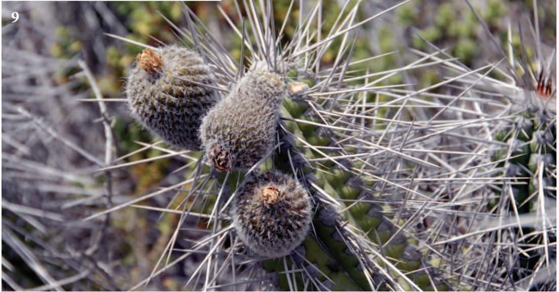
9 These images of Eulychnia chorosensis were taken on 6 November 2006 at Punta Choros, and show the bristly hypanthium.

the rank of species, when he described Eulychnia procumbens for a quite different plant. Backeberg (1977, Fig. 114) reproduces a good photo of his Eulychnia procumbens . It is believed to be a small growing form of Eulychnia breviflora similar to those found near Bahía Inglesa and illustrated by Leuenberger & Eggli (2000, Fig. 12). It was dismissed by Ritter as a synonym of Eulychnia breviflora .