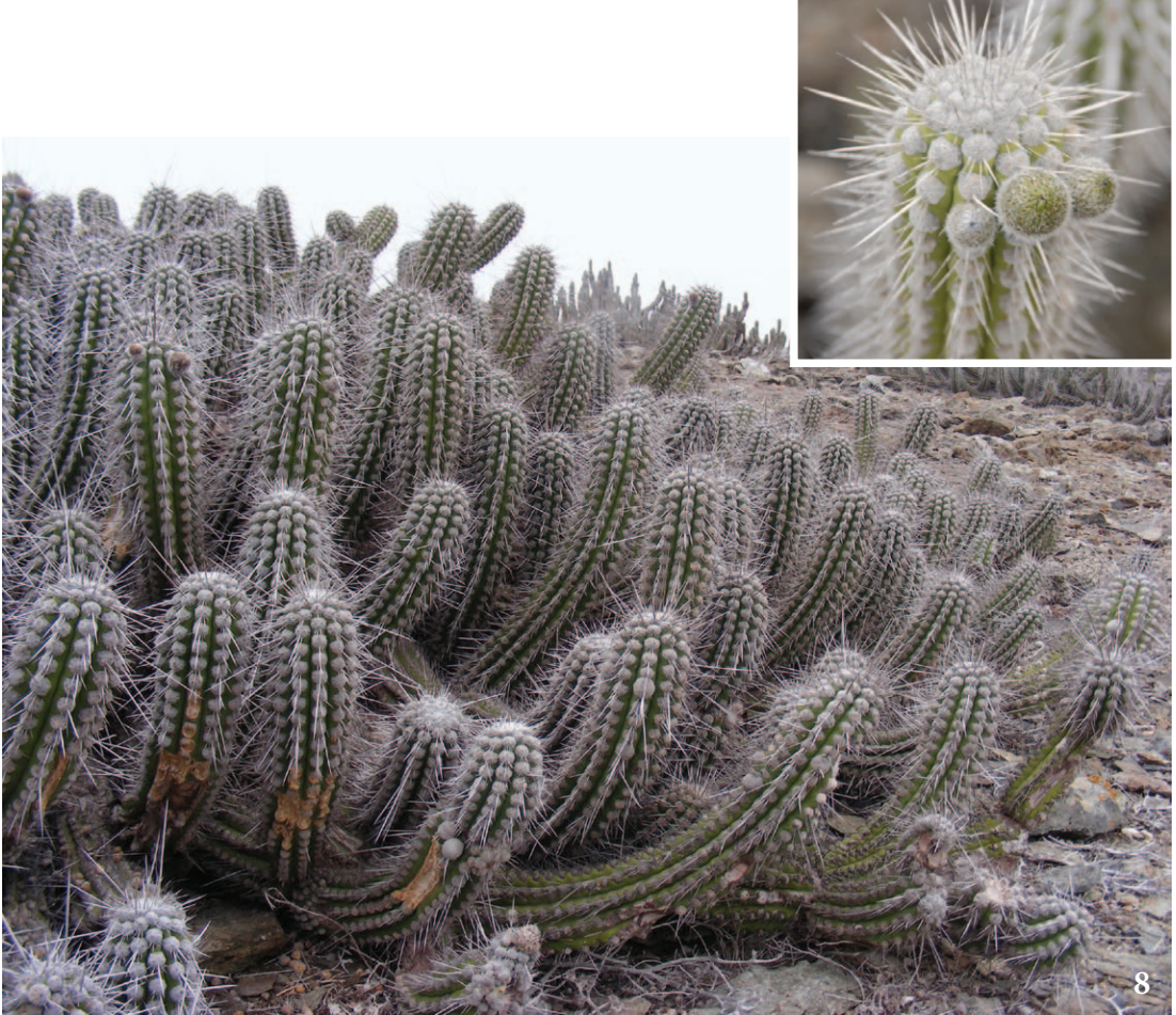
8 The sprawling stems are only found in the genus for E. chorosensis and E. castanea , which grows farther south, from Los Molles to Tongoy. Picture taken on 5 November 2007, on Isla Chañaral, just south of the Llanos de Choros, and part of the Humboldt Penguin National Reserve. Inset The large felted areoles and the 'more bristly than E. acida - less woolly than E. breviflora or E. iquiquensis ' buds.

and numerous filling the whole of the open flower. Anthers light yellow. Fruit globular, about 5cm in diameter, initially green turning brownish-green at maturity and retaining scales and dark brown wool. Pulp translucent white and acidic, containing numerous seeds. Fruit wall thick with large cells containing colourless mucilage. Seeds about 2 mm long, 1.2 mm wide, 0.5 mm thick, black-brown, matt.