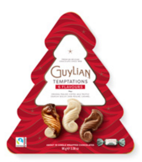
Holiday Guylian's Temptations Mix 10-piece Assortment RED Holiday Tree Pack. 96g/ 3.39 oz. 12/case GL637