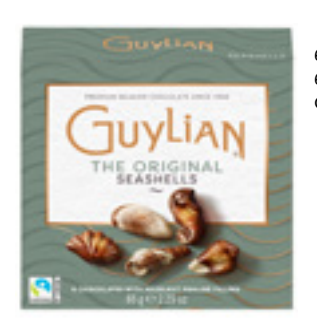
6-piece 65g/ 2.29oz. 24/case GL296

Our Seashells are Guylian's icons. World famous for their shapes and known as THE ORIGINAL. The distinctive shininess, the mix of marbled white, dark and milk chocolate and the diverse forms make every seashell unique. All Seashells are filled with our blend of our inhouse roasted delicious hazelnut praline.