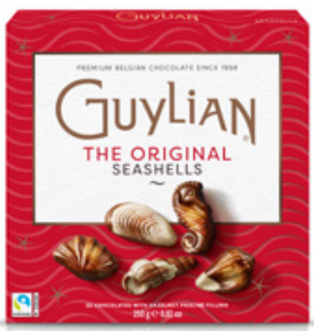
Holiday Seashells 22-piece 250g/8.8 oz. case of 12/case with RED Holiday Sleeve GL314

Share the happiness, enjoy the indulgence with our Guylian Giftboxes. For those special moments during the year, Guylian has a wide assortment of chocolate boxes to offer your beloved ones Christmas or Valentine we have the right box for every occasion.