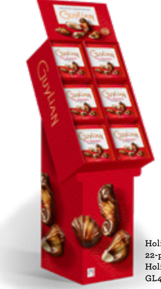
Holiday Seashells 22-piece gift boxes in RED Holiday Sleeve; 48 box DISPLAY GL414