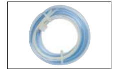
Pump-reservoir Connection hose