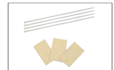
Cable ties and double-sided adhesive pad