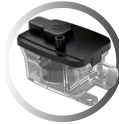
Reservoir & Level Sensor