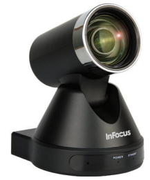
RealCam PTZ Camera

Thunder Speakerphone (INA-TH150): VoiceAware anti-echo & noise-reducing technology for any size meeting room