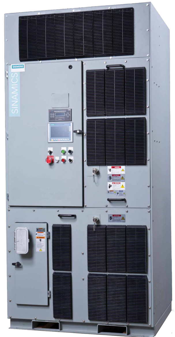
SINAMICS Perfect Harmony GH180 Air-Cooled Drive

* Certain HPs require a 24" cabinet for input voltages >7.2kV