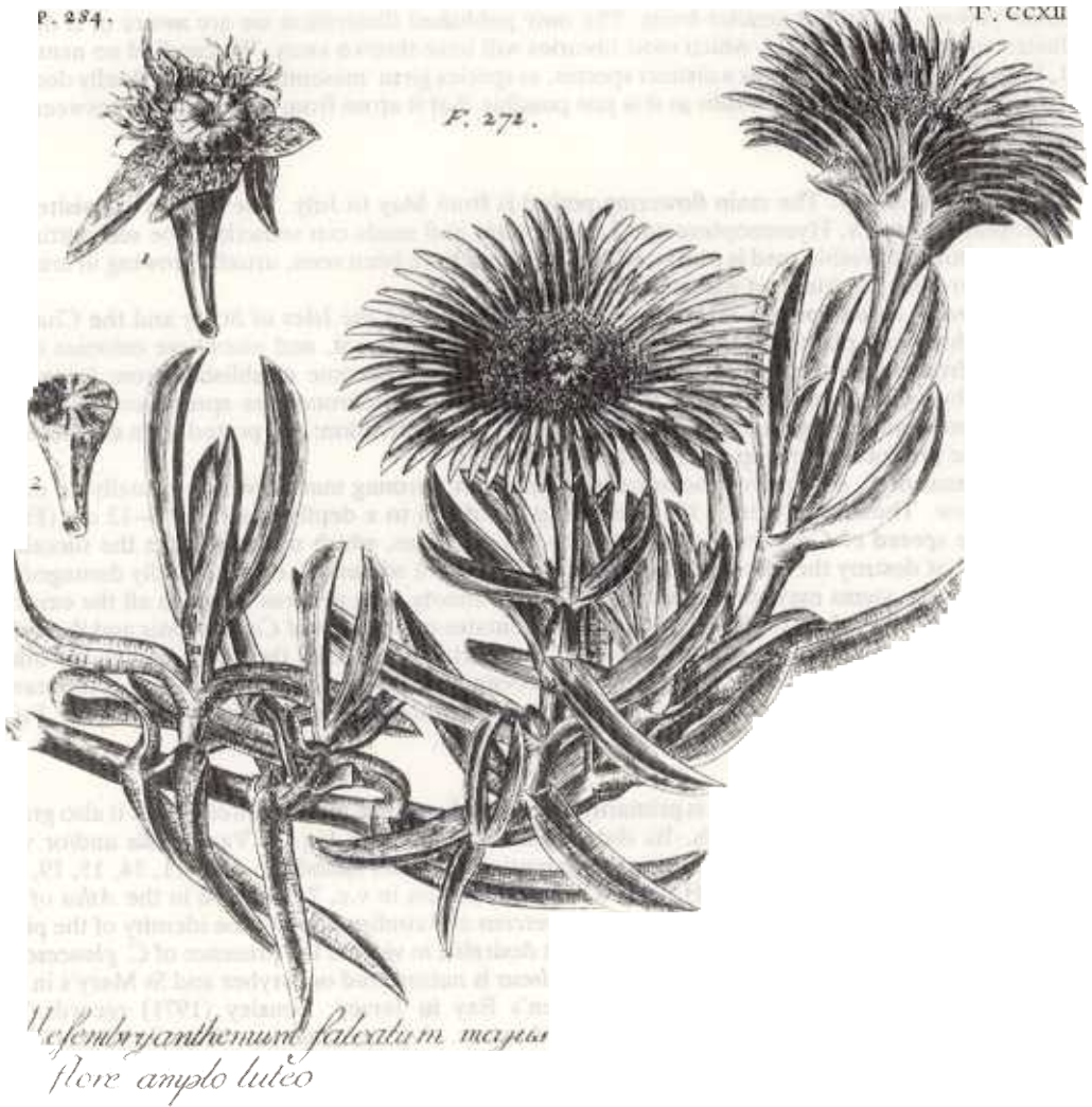
FIGURE 7. Carpobrotus edulis (L.) N.E.Br. var. edulis , illustrated as Mesembryanthemum falcatum majus, flore amplo luteo in Hortus Elthamensis 284, t. 212, fig. 272 (Dillenius 1732). The illustration is the lectotype of Mesembryanthemum edule L.

most studied, and there are colour photographs in CGE of the plant we pressed (Sell colour film 297/30, 31 & 32).