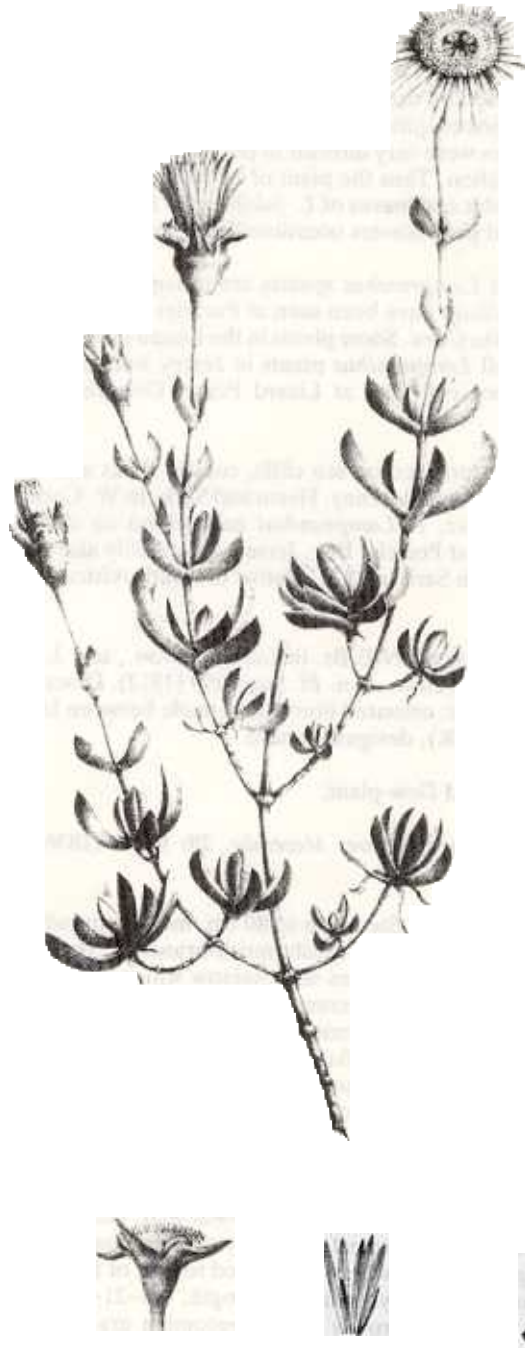
FIGURE 2. Lampranthus falciformis (Haw.) N.E.Br., illustrated as Mesembryanthemum falciforme in Salm-Dyck's Monographia Generum Aloes et Mesembryanthemi 29: fig. 1 (1836).