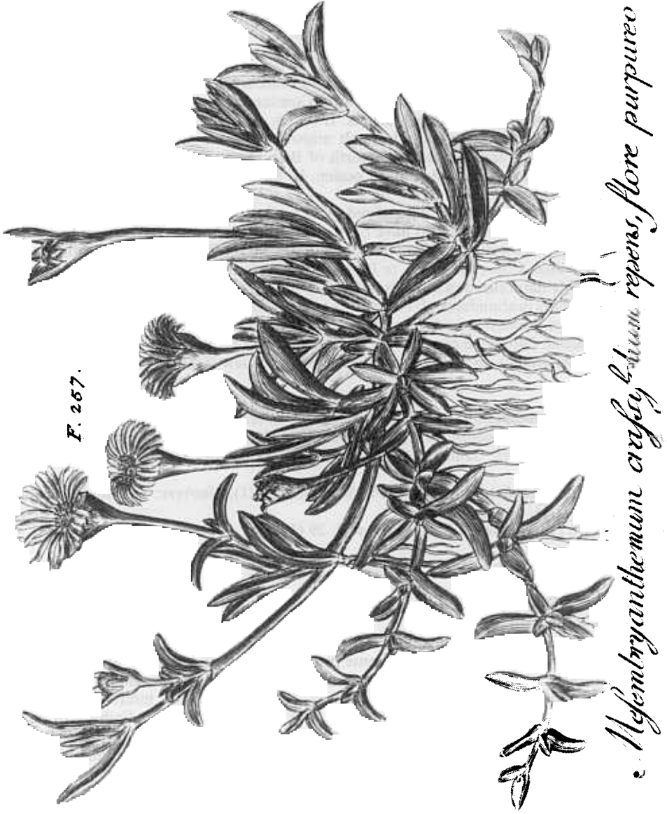
Mesembryanthemum crassifolium (L.) L. Bolus, repens , flore purpureo

FIGURE 4. Disphyma crassifolium (L.) L. Bolus, illustrated as Mesembryanthemum crassifolium (L.) L. Bolus, illustrated as Mesembryanthemum crassifolium L. (Dillenius 1732). The illustration is coloured by Dillenius is the