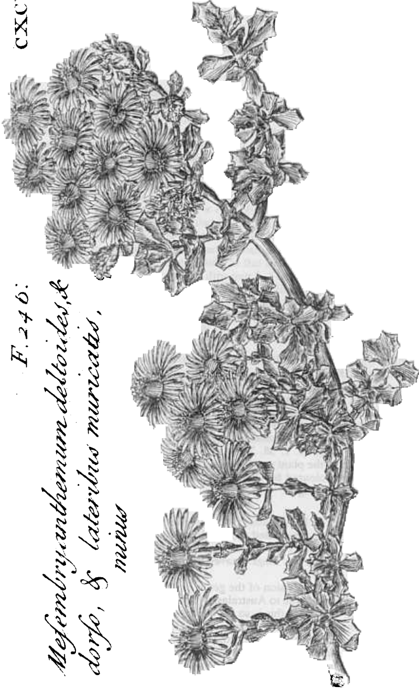
FIGURE 3. Oxycaria deltoides (L.) Schwantes, illustrated as Mesembryanthemum deltoides , & dorso , & lateribus muricatis , minus in Hortus Elthamensis 255, 195, fig. 246 (Dillenius 1732). The illustration coloured by Dillenius is the lectotype of Mesembryanthemum deltoides 1

Mesembryanthemum deltoides , & dorso , & lateribus muricatis , minus