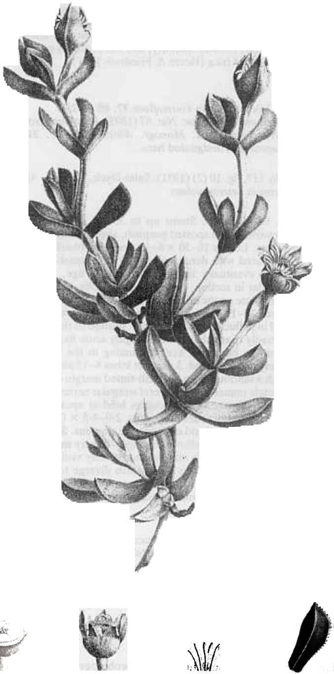
FIGURE 6. Erepsia heteropetala (Haw.) Schwantes, illustrated as Mesembryanthemum heteropetalum in Salm-Dyck's Monographia Generum Aloes et Mesembryanthemi 21: fig. 2 (1840). The coloured plate is the neotype of M. heteropetalum Haw.