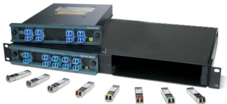
Figure 12. Cisco CWDM Extended Distance SFP Solution

The Cisco MDS 9000 family offers cost-effective multiprotocol extended distance connectivity that optimizes the use of a customer's existing optical infrastructure through the Cisco Coarse Wavelength-Division Multiplexing (CWDM) SFP solution (Figure 12). The Cisco CWDM SFP solution has two main components: a set of eight wavelength-specific SFPs and a set of CWDM optical add-drop modules (OADMs). A Cisco CWDM chassis enables rack-mounting of up to two Cisco CWDM OADMs. The Cisco CWDM OADMs are passive and require no power or configuration.