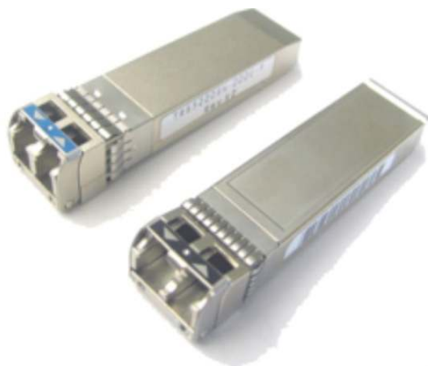
Figure 3. Cisco 8-Gbps Fibre Channel SFP+

The Cisco 8-Gbps Fibre Channel SFP+ (Figure 3) is designed to provide Fibre Channel connectivity for the 2/4/8-Gbps ports on the Cisco MDS 9000 Family platform. Three types of Cisco 8-Gbps Fibre Channel SFP+ are available: the Cisco Fibre Channel Shortwave SFP+ (part number DS-SFP-FC8G-SW) the Cisco Fibre Channel Longwave SFP+ (part number DS-SFP-FC8G-LW), and the Cisco Fibre Channel Extended Reach SFP+ (part number DS-SFP-FC8G-ER). Each product offers 2/4/8-Gbps autosensing Fibre Channel connectivity.