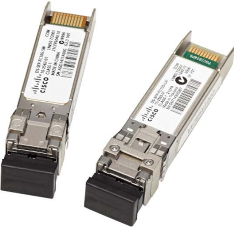
Figure 4. Cisco 10-Gbps Fibre Channel SFP+

The Cisco 10-Gbps Fibre Channel SFP+ (Figure 4) is designed to provide Fibre Channel connectivity for the 10-Gbps Fibre Channel ports on the Cisco MDS 9000 Family platform. Two types of Cisco 10-Gbps Fibre Channel SFP+ are available: the Cisco Fibre Channel Shortwave SFP+ (part number DS-SFP-FC10G-SW) and the Cisco Fibre Channel Longwave SFP+ (part number DS-SFP-FC10G-LW).