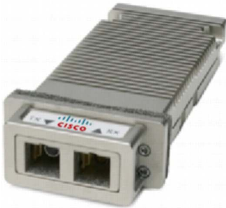
Figure 11. Cisco 10-Gbps Ethernet X2 Transceiver

The Cisco Ethernet X2 Transceiver Short Reach (up to 300m; part number DS-X2-E10G-SR) enables high-performance Fibre Channel connectivity for the Cisco MDS 9000 family 10-Gbps Fibre Channel switching module to an existing Ethernet Dense Wavelength-Division Multiplexing (DWDM) transponder (Figure 11). The data format transmitted by the Ethernet X2 transceiver (DS-X2-E10G-SR) onto the fiber is identical to that transmitted by the Fibre Channel transceiver (DS-X2-FC10G-SR), except that the Fibre Channel packets are clocked at the 10 gigabit Ethernet rate, which allows Fibre Channel packets to be carried over an existing 10-Gbps Ethernet DWDM infrastructure. The Cisco MDS 9000 family 10-Gbps Fibre Channel switching module will automatically detect DS-X2-E10G-SR; no software configuration is required.