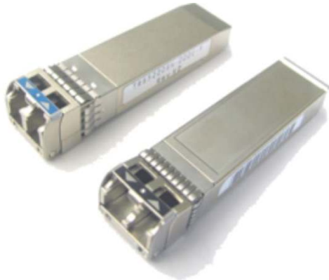
Figure 10. Cisco 16-Gbps Fibre Channel SFP+ Transceivers