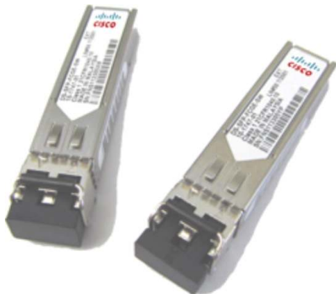
Figure 2. Cisco 4-Gbps Fibre Channel SFPs