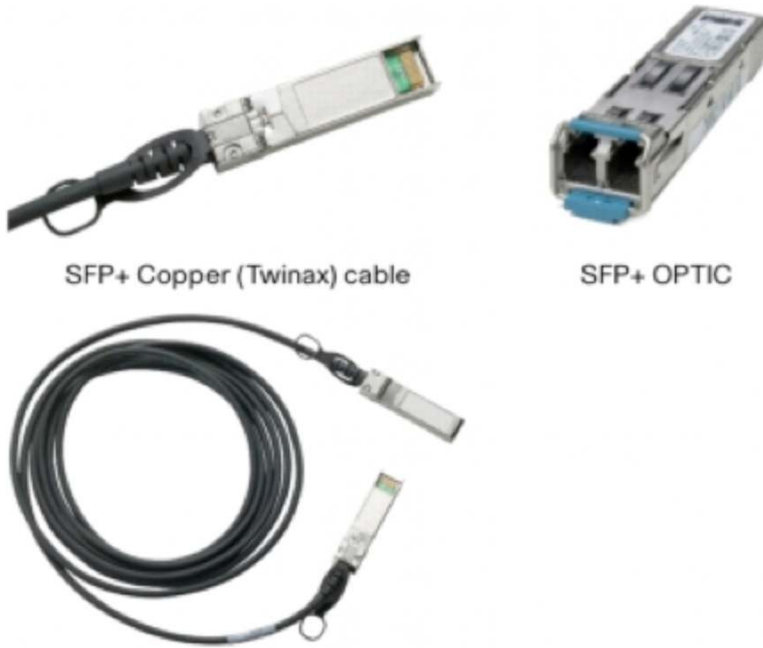
SFP+ Copper (Twinax) cable