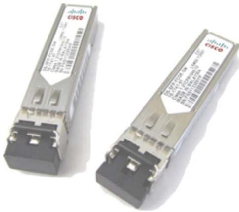
Figure 1. Cisco 2-Gbps Fibre Channel SFPs

The Cisco 2-Gbps Fibre Channel SFPs (Figure 1) are designed to provide cost-effective Fibre Channel connectivity for the Cisco MDS 9000 Fibre Channel switching modules. Two types of Cisco 2-Gbps Fibre Channel SFP are available: the Cisco Fibre Channel Shortwave SFP (part number DS-SFP-FC-2G-SW) and the Cisco Fibre Channel Longwave SFP (part number DS-SFP-FC-2G-LW). Each product offers 1/2-Gbps autosensing Fibre Channel connectivity.