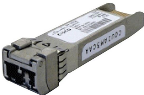
Figure 1. Cisco DWDM SFP+ module

The Cisco 10GBASE DWDM SFP+ Modules (Figure 1) are fiber transceivers for a wide variety of Cisco switches, routers, and other equipment. They allow enterprises and service providers to provide scalable and easy-to-deploy 10-Gbps LAN and WAN services in their networks.