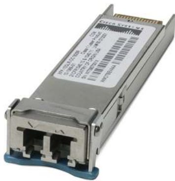
Figure 1. Cisco XFP Module

Main features of the Cisco XFP Module include: