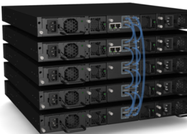
Figure 1: Brocade ICX 6610 Switches can be stacked using four standard 40 Gbps QSFP ports that provide a fully redundant virtual chassis backplane with 320 Gbps of stacking bandwidth.

With capabilities such as bandwidth on demand, the Brocade ICX 6610 enables organizations to grow their networks when necessary. Organizations can initially deploy 1 GbE uplink ports and upgrade to 10 GbE ports when desired with an easy-to-activate software license.