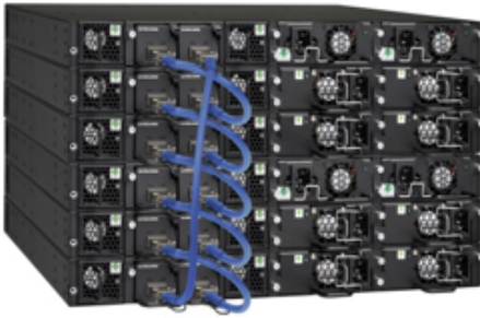
Figure 3: Brocade ICX switches can be stacked together using standard SFP+ or QSFP+ ports and optics to create a single logical device over distances up to 10 Km