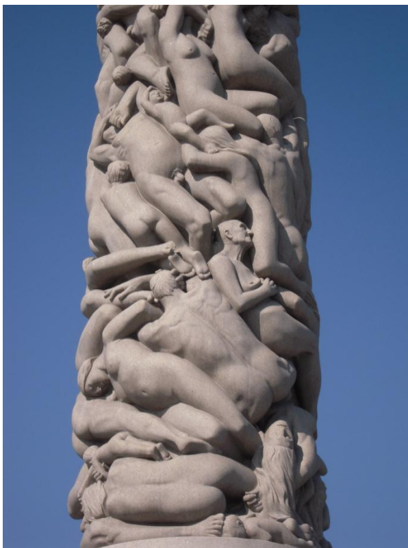
Fig. 2. Gustav Vigeland, The Monolith (detail), The Vigeland Park in Oslo.