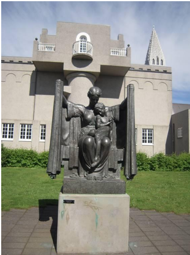
Fig. 6. Einar Jónsson Museum in Reykjavik, view from the garden.