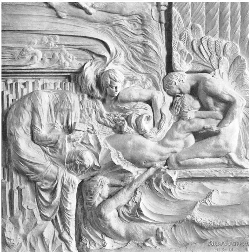
Fig. 7. Einar Jónsson, The Birth of Psyche . Courtesy Einar Jónsson Museum in Reykjavik.