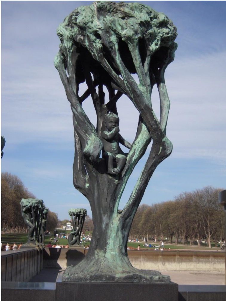
Fig. 4. Gustav Vigeland, The Vigeland Park in Oslo.