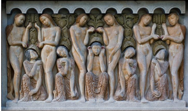
Fig. 5. Bernhard Hoetger, The Resurrection , The Plane Tree Grove in Darmstadt. Wikimedia Commons.