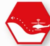
EXACT TERRAIN FOLLOWING