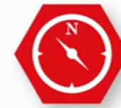
ACCURATE COURSE NAVIGATION