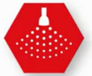
AUTOMATED CROP SPRAY