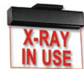
Custom legends available