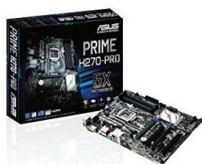
Asus MB PRIME H270-PRO ASU-90MB0SX0M0UAY0