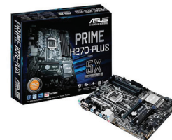
Asus MB PRIME H270-PLUS ASU-90MB0S90M0UAY0