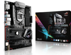
Asus MB STRIX Z270H GAMING ASU-90MB0SS0M0UAY0