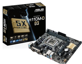
Asus MB H110M-D ASU-90MB0PY0M0UAY0