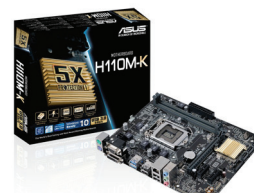
Asus MB H110M-K ASU-90MB0PH0M0UAY0