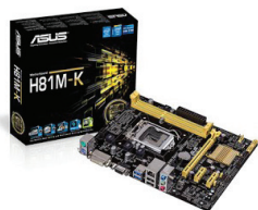
Asus MB H81M-K ASU-90MB0H10M0UAY1