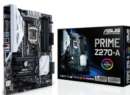
Asus MB PRIME Z270-A ASU-90MB0RU0M0UAY0