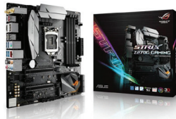
Asus MB STRIX Z270G GAMING ASU-90MB0S80M0UAY0