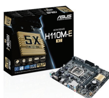
Asus MB H110M-E/M.2 ASU-90MB0R0K0M0UAY0