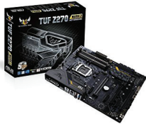
Asus MB TUF Z270 MARK 1 ASU-90MB0S20M0UAY0