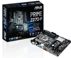
Asus MB PRIME Z270-P ASU-90MB0SY0M0UAY0