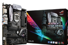
Asus MB STRIX H270F GAMING ASU-90MB0S70M0UAY0