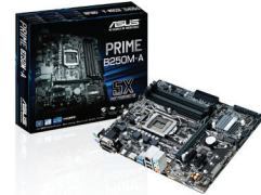
Asus MB PRIME B250M-A ASU-90MB0SR0M0UAY0