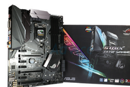
Asus MB STRIX Z270F GAMING ASU-90MB0SV0M0UAY0