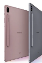
SM-T865NZAATHL 6GB/128GB SSG-SM-T865NZAATHL (GRAY) SSG-SM-T865NZNATHL (ROSE BLUSH)