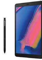
SM-P205 (Tab A 8.0 2019) S-Pen SSG-PSMP205NZAATHL (GRAY) SSG-PSMP205NZKATHL (BLACK)