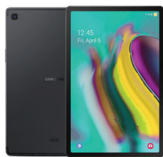
SM-T725NZKATHL (Tab S5e 10.5") SSG-PSMT725NZKATHL (BLACK)