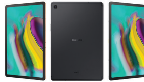
SM-T515 (Tab A10.1_2019) SSG-PSMT515NZDETHL (GOLD) SSG-PSMT515NZKETHL (BLACK) SSG-PSMT515NZSETHL (SILVER)