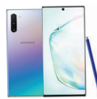
SM-N970 (Note10 8GB256GB)

SSG-SM-G975FZGDTHL (GREEN) SSG-SM-G975FZKDTHL (BLACK) SSG-SM-G975FZWDTHL (WHITE)