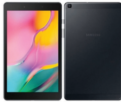
SM-T295_Tab A 8" 2019 SSG-SM-T295NZKATHL (BLACK) SSG-SM-T295NZSATHL (SILVER)