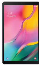
SM-T510 (Wi-Fi) B2B SSG-PSMT510NZKDTLH (BLACK)