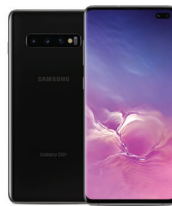
SM-G975 (S10+, 128GB)

SSG-SM-A805FZDDTHL (GOLD) SSG-SM-A805FZKDTHL (BLACK) SSG-SM-A805FZSDTHL (WHITE)