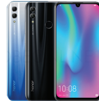
Honor 10 Lite

HNR-6901443273546 (Midnight Black) HNR-6901443273560 (Sky Blue)