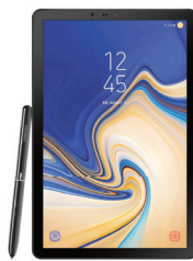
SM-T835NZKATHL (Tab S4 10.5") S-Pen SSG-PSMT835NZKATHL (BLACK)