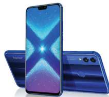
Honor 8X PRO

HNR-6901443268313 (Black) HNR-6901443268320 (Blue)