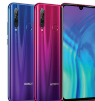
Honor 20 Lite

HNR-6901443297870 (Phantom Blue) HNR-6901443297887 (Phantom Red)