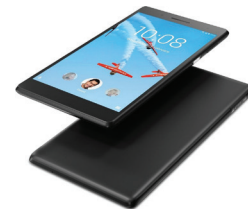
TAB4 7304X LNV-ZA330067TH (Black)