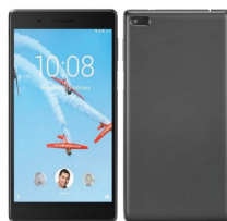
TAB4 7504X LNV-ZA380137TH (Black)