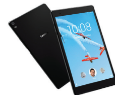
TAB4 8HD LNV-ZA2D0078TH (Black)