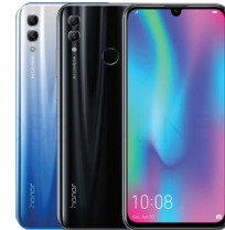
Honor 10 Lite

HNR-6901443273546 (Midnight Black) HNR-6901443273560 (Sky Blue)