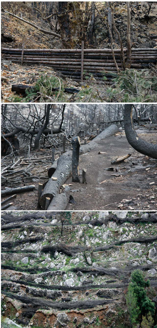
Fig. 5.4 Forms of barriers to control post-fire soil erosion; upper image : branches barriers placed across a stream (Arkadia 2007 fire, Greece. Source Margarita Arianoutsou, Univ. of Athens); middle image : log barriers (Mt. Parnitha 2007 fire, Greece. Source Margarita Arianoutsou, Univ. of Athens); lower image : fine branches barriers, (Useres 2007 fire, Valencia Region, Spain. Source: Teresa Gimeno, CEAM)