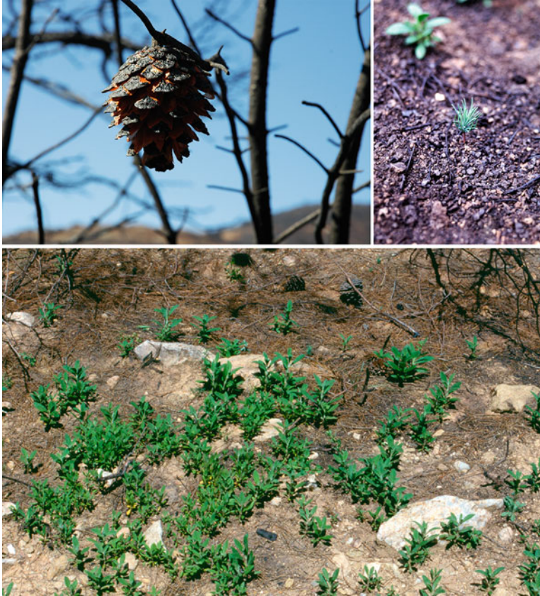
Fig. 5.3 Obligate seeders. Upper image: (left) serotinous cone of Pinus halepensis ; (right) Pinus halepensis seedling. Lower image: Cistus creticus seedlings massively appearing on the burned ground.