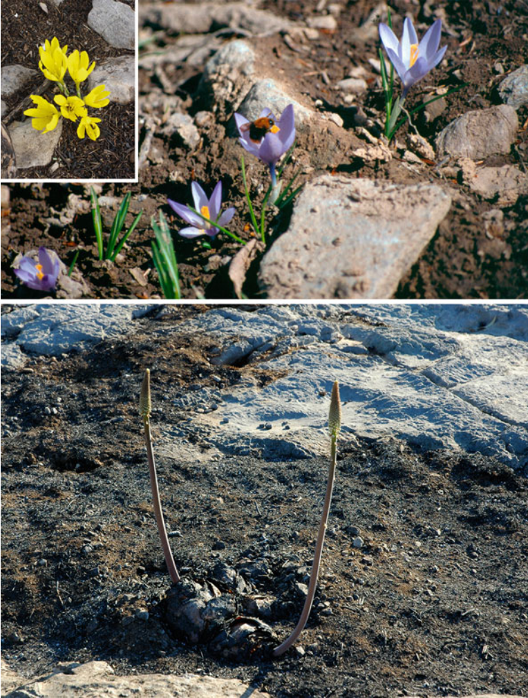
Fig. 5.1 Geophytes resprouting after fire from underground bulbs; lower image : Urginea maritima ; upper inner image Sternbergia sp.; upper image : Crocus sp.

usually at the root crown of the burned plants from dormant buds that remained intact after fire, being protected by the insulating soil. Resprouting is also the regeneration mechanism of plants that possess lignotubers, such as Euphorbia acanthothamnos , Erica arborea , E. australis , E. multiflora , or underground bulbs as many geophytes do, e.g. Cyclamen spp., Muscari commosum , Urginea maritima , Crocus spp. (Fig. 5.1).