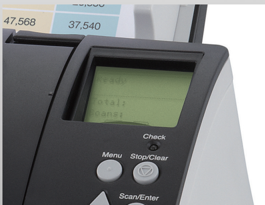
Integrated LCD operating panel

The fi-7180, fi-7280, fi-7160 and fi-7260 come with Scanner Central Admin tools that includes functions that system administrators can use to manage the installation and operation of multiple scanners, monitor operation status and update drivers and software from one location. This ability dramatically reduces the cost and work that goes into setting up, operating and maintaining many scanners in an organisation and also in expanding the scanner network to multiple locations.