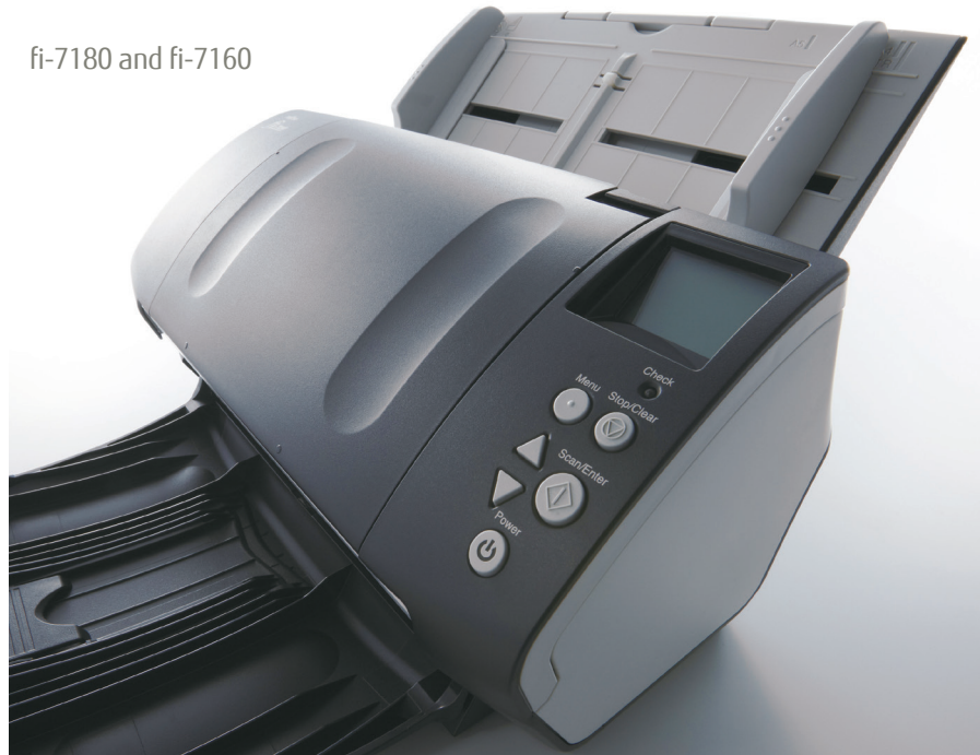
fi-7180 and fi-7160