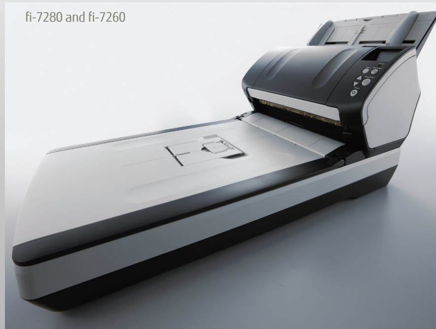
fi-7280 and fi-7260

Carrier sheets allow you to scan documents, larger than A4 or photos and clippings that are at risk of being damaged when processed through an ADF. {Part Number – PA03360-0013}