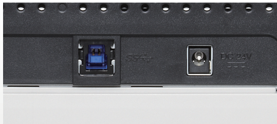
High speed performance through USB 3.0 interface

All four scanner models additionally make use of an ultrasonic sensor that accurately detects multifeed errors where two or more sheets are fed through the scanner at once plus intelligent multifeed function that is designed for documents that intentionally feature paper attachments of defined sizes or locations such as sticky notes or photos. The scanner can automatically recognise the location of the attachment and will then exclude that zone from triggering alert conditions.