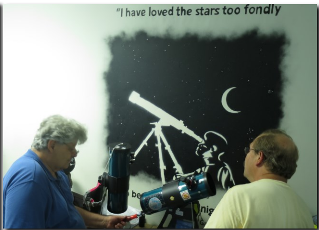
Above left: HALF of the telescopes waiting to be completed Above right: Collimating the telescopes in front of an appropriate mural!