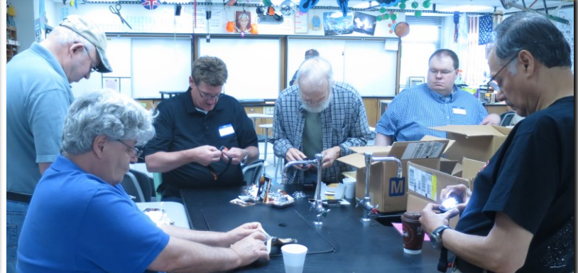
Above left: The eyepiece glue team at work Above right: Equipping headlights with batteries