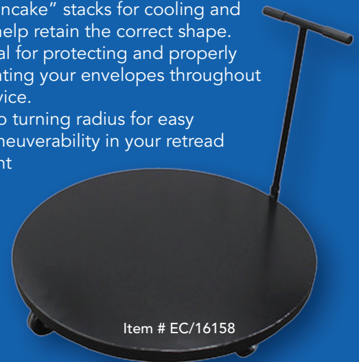
Item # EC/16158