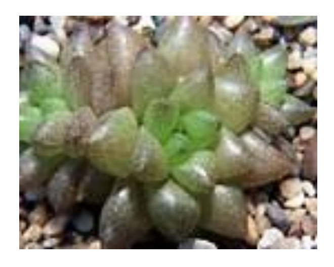
Haworthia reticulata