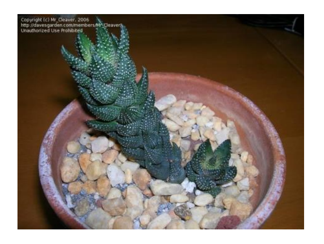
Haworthia coarctata var tenuis From Dave's Garden