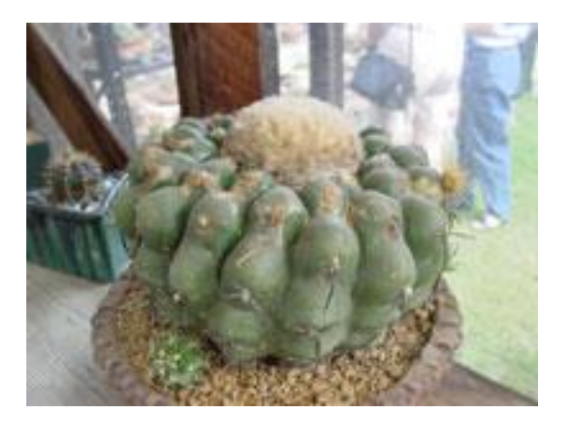
Discocactus heptacanthus