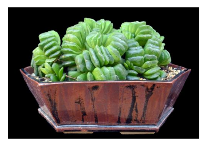
Haworthia 'lemon lime'