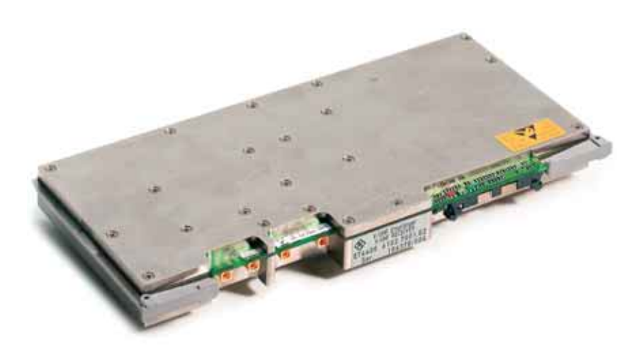
Main Receiver Module R&S ET 4400

The R&S VT 4403 is a universal transmitter module for all operational modes in the frequency range 100 MHz to 512 MHz and is mounted in the R&S KR 4400. This means that there is one transmitter for each radio. A PIN diode switch is provided for fast and reliable switchover between transmission and reception. Two low-noise, temperature-controlled fans are provided on the rear panel for heat dissipation of the transmitter.