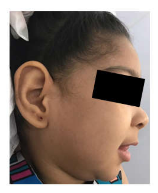
Figura 3. Facial photographs of patient with severe Microcephalyat 3 years and 6 months old. Pattern II, dolicofacial (aandb)