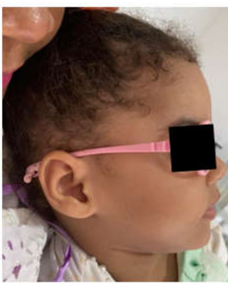
Figure 4. Facial photographs of patient with Microcephaly at 3 years and 5 months of age. Pattern I, dolicofacial (aandb)