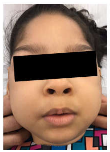
Note: Upper third narrow and plane (aandb).