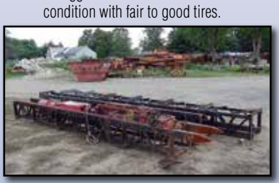
10 PILECO D19-42

1968 LIMA Model 350T, 35 Ton Conventional Truck Crane, s/n 3541-6, Detroit 6-71 diesel engine, 140' pin connected tubular boom (40' basic; (1) 30', (2) 20', and (3) 10' inserts), 20' jib, 3rd drum, Liftech anti-2 block device, air controls, mounted on 8x4 carrier, s/n 4857-4, Int'l DT466 diesel engine and automatic transmission, (4) hydraulic outriggers and 12.00-20 tires. In fair