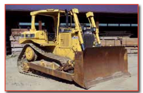
99 CAT D6R