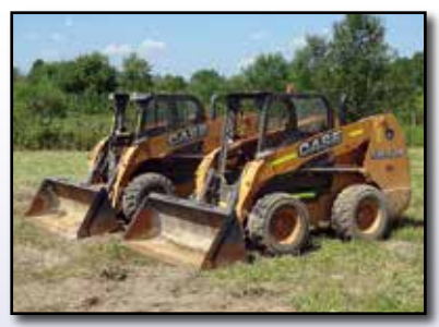
(2) OF (3) `12 CASE SR220

2012 CASE Model SR220 Skid Steer Loader. s/n NCM457252. Case 4 cylinder diesel engine and hydrostatic