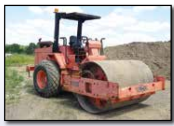
95 HAMM 2420D

1994 BOMAG Model BW172D-2 Vibratory Compactor, s/n 109520120240R, Deutz diesel engine and hydrostatic transmission. 66" smooth drum, drum drive, ROPS canopy, and 14.9-24 tires. In good condition with good tires. (01,298 Hours)