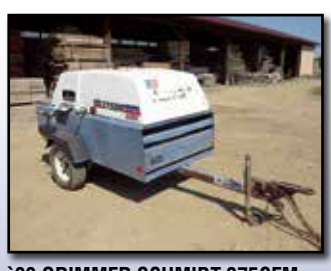
99 GRIMMER SCHMIDT 375CFM

1999 GRIMMER SCHMIDT Model 375DR, 375CFM Portable Air Compressor, s/n 375DR-21905, JD 4.5L diesel engine, 205/75R15 tires. In good condition with fair tires. (3,205 Hours)