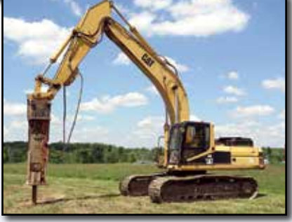
96 CAT 330L AND NPK GH15 (SOLD SEPARATELY)

1996 CATERPILLAR Model 330L Hydraulic Excavator, s/n 5YM01764, Cat 3306B diesel engine and hydraulic drive, 12'6" dipper stick, hydraulic coupler, 2-way auxiliary hydraulics, thumb bracket, Cat 42" digging bucket, enclosed cab with heat and air conditioning, and 33.5" TBG pads. In fair to good condition with fair undercarriage. (09,011 Hours)