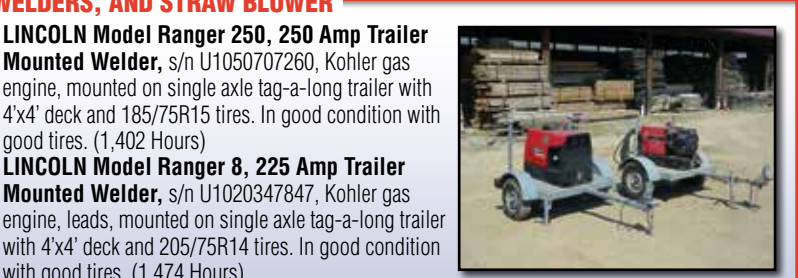
(2) LINCOLN WELDERS

Mounted Welder, s/n U1050707260, Kohler gas