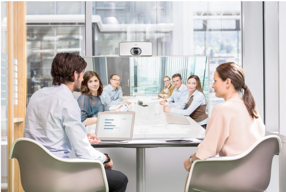
Figure 1. Cisco SX10 Quick Set in a Huddle Space

High quality, simplicity, and affordability come together in the SX10 Quick Set to create a practical and powerful business class solution for video ubiquity (Figures 1 through 3).