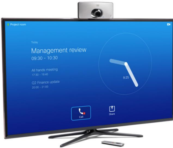
Figure 2. Cisco SX10 Quick Set Mounted with Remote Control