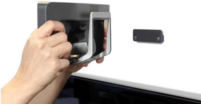
Figure 3. Cisco SX10 Wall-Mount Solution