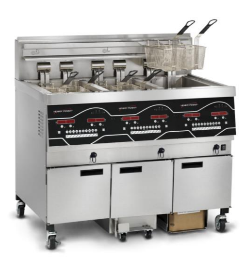
EEE 143 3-well open fryer