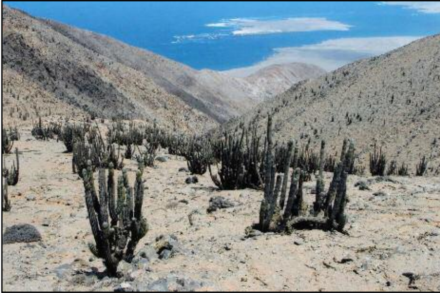
Eulychnia iiquensis at 700m