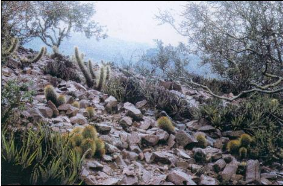
Near El Puente