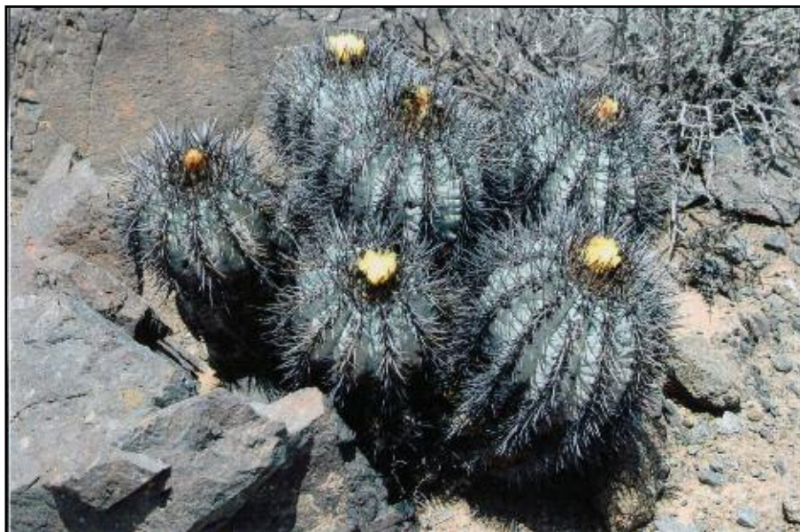
Copiapoa atacamensis at 700m