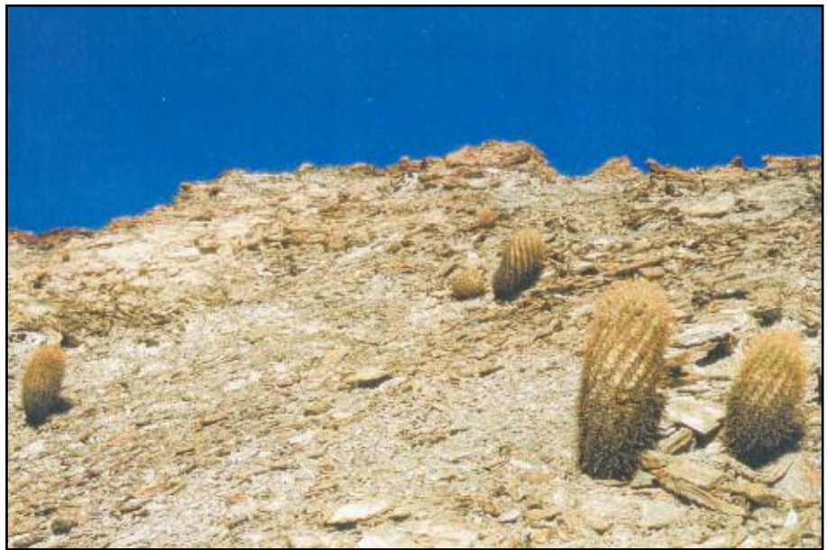
West of San Pedro