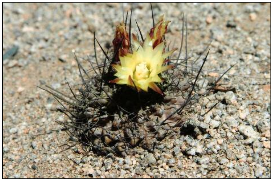
Neochilenia vexata at 700m