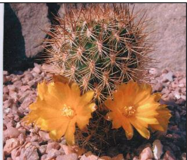
Sulcorebutia cylindrica VZ 153