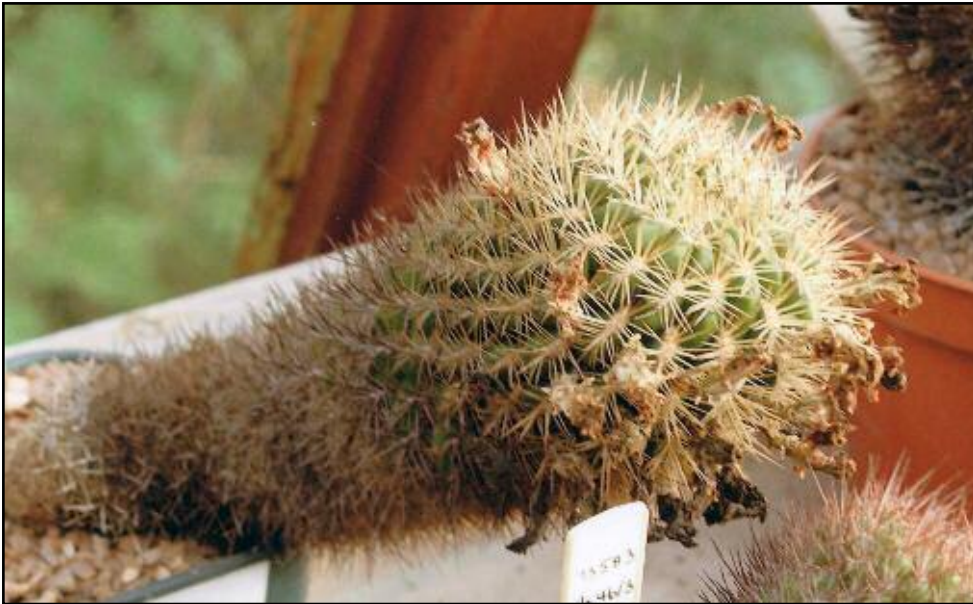
Sulcorebutia cylindrica HS 46