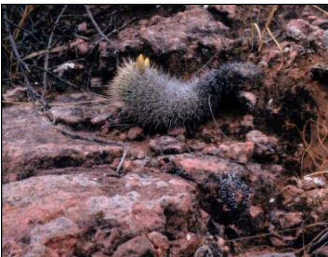
Sulcorebutia cylindrica near Chaguarani