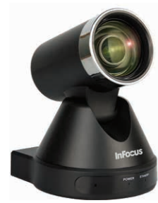
RealCam PTZ Camera

Thunder Speakerphone (INA-TH150): VoiceAware anti-echo & noise-reducing technology for any size meeting room.