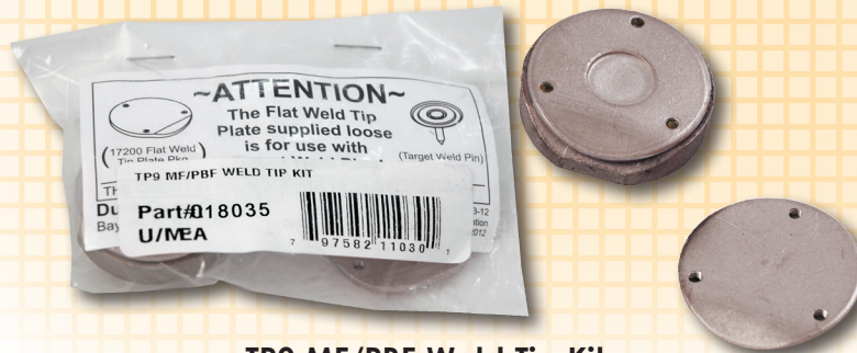
TP9 MF/PBF Weld Tip Kit Part# 18035 (replaces #27230)

Duro Dyne Corporate Headquarters, Bay Shore, NY 631-249-9000 • Fax: 631-249-8346 Duro Dyne Midwest • Duro Dyne West • Duro Dyne Canada www.durodyne.com • E-mail: durodyne@durodyne.com