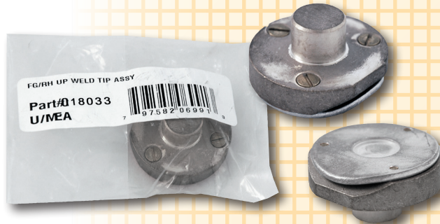
FG, RH & MH Upper Weld Tip Assy Part# 18033 (replaces #17191)