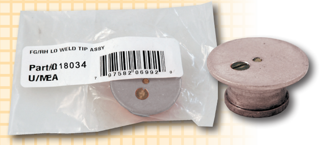
FG, RH & MH Lower Weld Tip Assy Part# 18034 (replaces #17192)