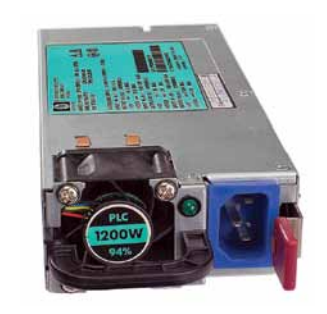
HP 1200 W CS Platinum Power Supply