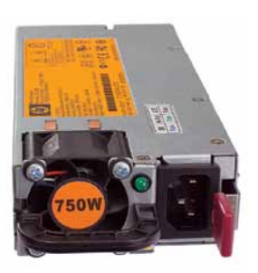
HP 750 W CS HE Power Supply