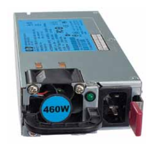
HP 460 W CS HE Power Supply