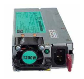
HP 1200 W CS HE Power Supply