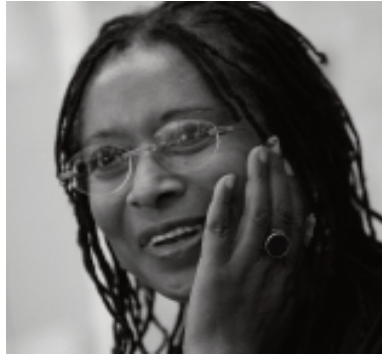
Black History Month graphic . Toni Morrison.

Amid the harsh repression of slavery, Americans of African descent, and particularly black women, managed—sometimes at their own peril—to preserve the culture of their ancestry and articulate both their struggles and hopes in their own words and images. A growing number of black female artists and writers emerged throughout the Civil War and Reconstruction eras before finally bursting into the mainstream of American culture in the 1920s, with the dawn of the Harlem Renaissance. After playing a significant role in both the civil rights movement and the women's movement of the 1960s, the rich body of creative work produced by black women has found even wider audiences in the late 20th and early 21st centuries.