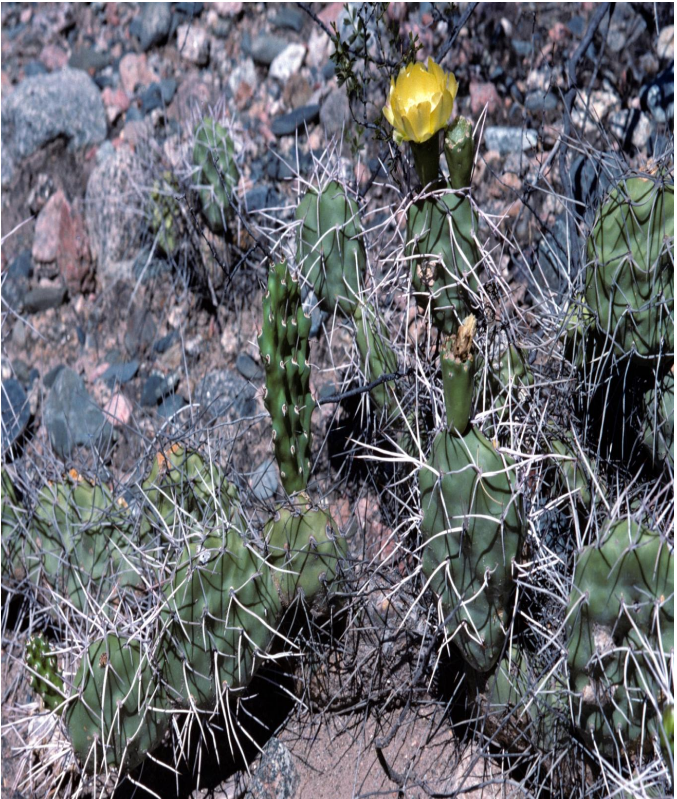
Figure 1: Opuntia sulphurea ssp. sulphurea (Argentina, La Rioja, Famatina, 13 km N of Chilecito towards Famatina, 0.5 km N of department frontier, 1150 m, roadside alluvial plain with fine sandy soil, 30 Dic. 1994). Photo: B. Leuenberger & U. Egli 4391c.