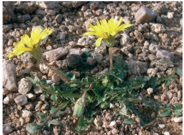
Fig. 4. Taraxacum minimum.