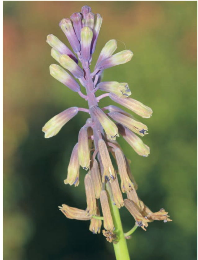
Fig. 21. Bellevalia trifoliata.

An interesting discovery, the records are new for mainland Peloponnese. The species has, however, been collected from the offshore islands of Aegina and Kithira. In Greece, recorded only from the E Aegean islands, Crete and Karpathos. Bellevalia trifoliata can be considered an archaeophyte weed, i.e., introduced by man in earlier times intentionally or unintentionally, and becoming established, spreading effectively either vegetatively or by seed. Archaeophytes are usually restricted to man-made habitats, including cereal fields. At Sikyon, 2–3 plants were found five years ago, in waste ground surrounding the cereal fields but a motorcycle race-track has now been constructed and the plants were not sighted this year. There were more than a 100 individuals observed in Kiato, in a grassy plot together with Allium and Galium verum . However, it was difficult to investigate the area as the surrounding fields were fenced and the owners wary of intruders.