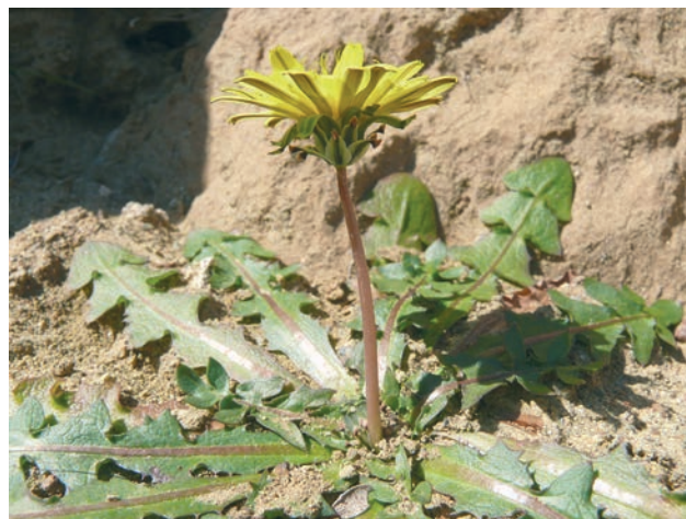
Fig. 1. Taraxacum aleppicum.

New for the N Aegean area and first record for the Greek islands.