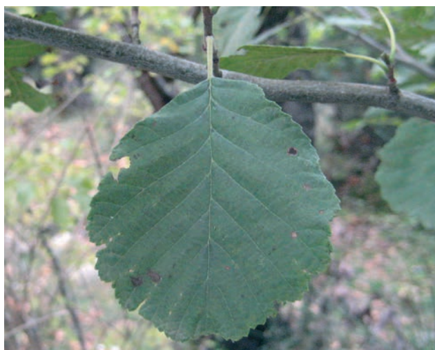
Fig. 7. Alnus glutinosa subsp. glutinosa.

New for Mt Menalo in central Peloponnese. Within A. glutinosa , three subspecies have been recognized. This shrub-like plant has hairy stems and leaves more coriaceous and hairy beneath than in the typical form which is usually glabrous. According to Zieliński, this morphotype has been collected in northern Greece by A. Boratyński (Poznan) and if found to be more widespread, may be treated as a separate taxon.