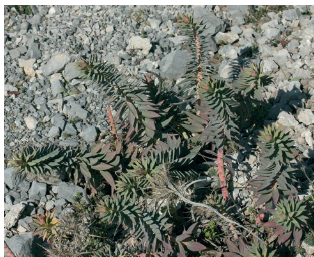
Fig. 9. Euphorbia rigida.

Not listed from Kitheronas by Constantinidis (1997). There were thousands of plants in vegetative state, together with Crocus olivieri , Crocus sieberi subsp. atticus , Erophila praecox , Erodium cicutarium and Allium chamaemoly which were all in full flower at the end of January.