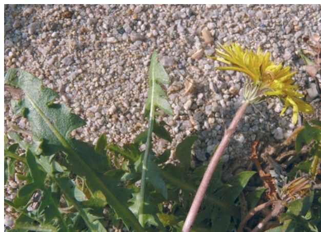
Fig. 2. Taraxacum calocephalum.