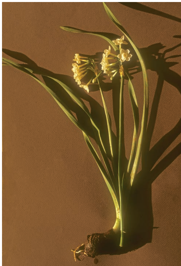
Fig. 13. Narcissus papyraceus.

Gr Nomos Kefallinias, Eparchia Samis: Kefalonia, river banks and damp meadows near the village of Koulouráta, 38°20'N, 20°30'E, 13.12.2005, Sfikas 13707 (herb. Sfikas; det. Kit Tan, May 2012).