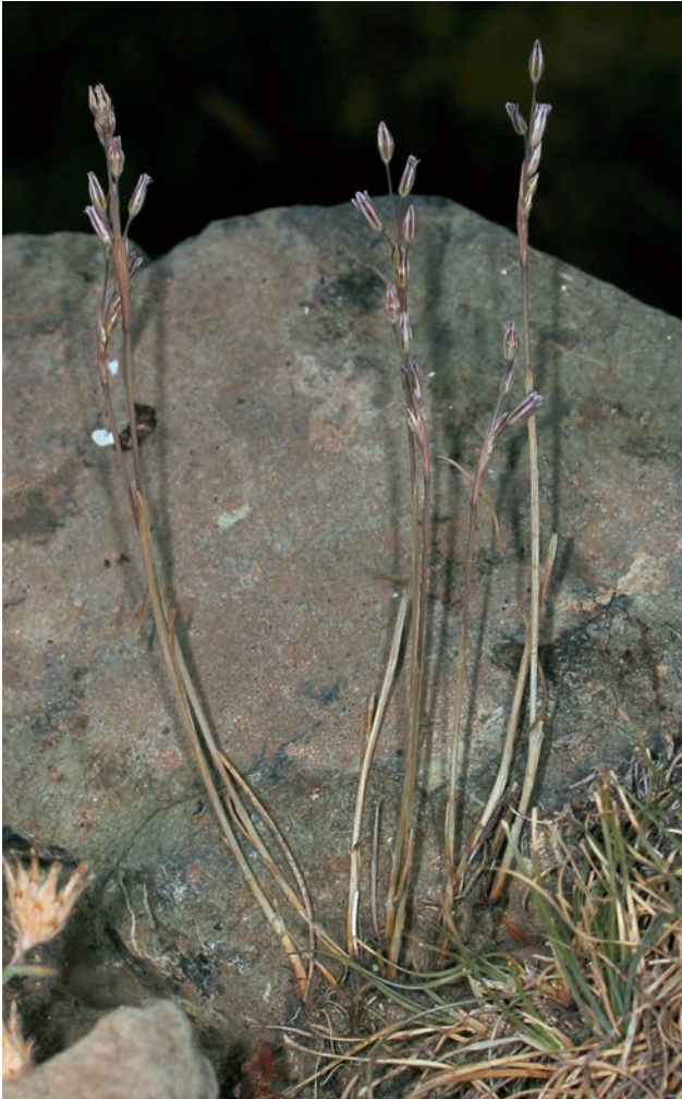
Fig. 12. Allium cupani.

New for Mt Dirfis. Together with Juniperus oxycedrus , Genista millii and Minuartia dirphyia . Recorded from Mt Ochi in southeastern Evvia.