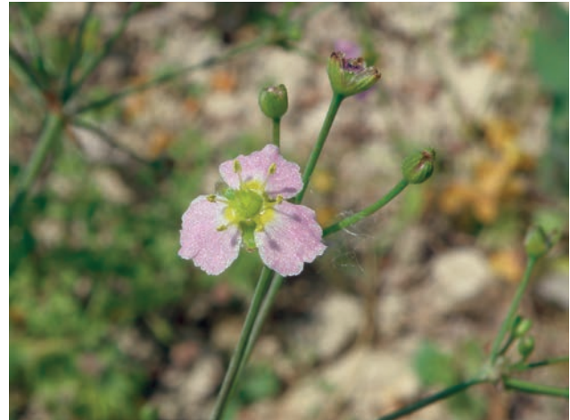
Fig. 18. Alisma lanceolatum.

New for eparchia and nomos. Several plants in wet ditch at margin of Old National Road from Corinthos to Kiato. Alisma gramineum is the other species of Alisma recorded from Korinthias, collected at Lake Stymfalia.