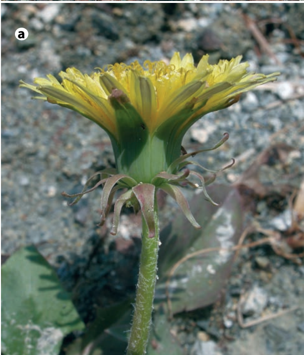
Figs. 3 & 3a. Taraxacum capricum.

24. Taraxacum minimum (Briq.) Terracc. (Fig. 4) Gr Samothraki: SW of Kamariotissa, grazed uncultivated ground outside village, on coastal limestone, 5 m, 40°28'11"N, 25°28'00"E, 02.04.2006, Biel 06.006; Pachia Ammos, low rocky ridge with phrygana east of beach, 30 m, 40°23'32"N, 25°35'05"E, 02.11.2008, Biel 08.320; Pachia Ammos, sandy beach with Vitex scrub, 7 m, 40°23'45"N, 25°34'46"E, 07.05.2010, Biel 10.298; S-SE of Therma, ravine above Aetos, rocky slope with Pteridium , 850 m, 40°27'55"N, 25°37'16"E, 09.05.2010, Biel 10.394; SW of Therma, mountain saddle with phrygana on NW ridge of Fengari, rocky basalt and granite, 1470 m, 40°28'01"N, 25°34'52"E, 13.05.2010, Biel 10.537; N-NE of Pachia Ammos, gorge and slopes of Kousianda stream, 800 m, 40°25'21"N, 25°36'30"E, 30.06.2010, Biel 10.792; W of Xiropotamos, source of spring, with planted Juglans and Olea at foot of slope, 90 m, 40°26'44"N, 25°31'31"E, 07.02.2011, Biel 11.009a; roadsides and waste ground in Kamariotissa, 15 m, 40°28'45"N, 25°28'32"E, 10.02.2011, Biel 11.049.