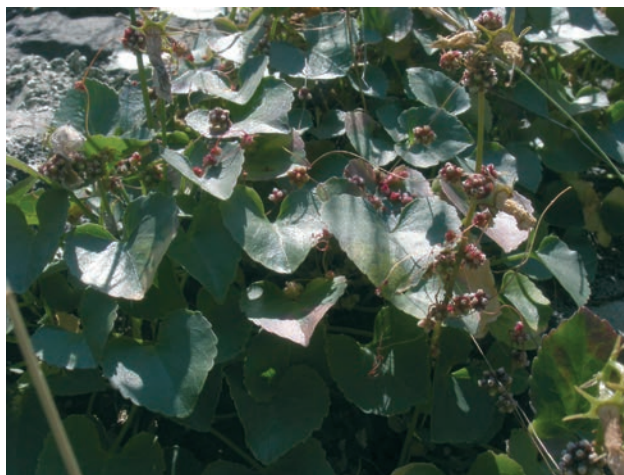
Fig. 5. Cuscuta palaestina on Symphyandra samoethracica.

Recorded from Thasos and Ag. Evstratios. On various hosts of which Symphyandra samoethracica appears to be new.