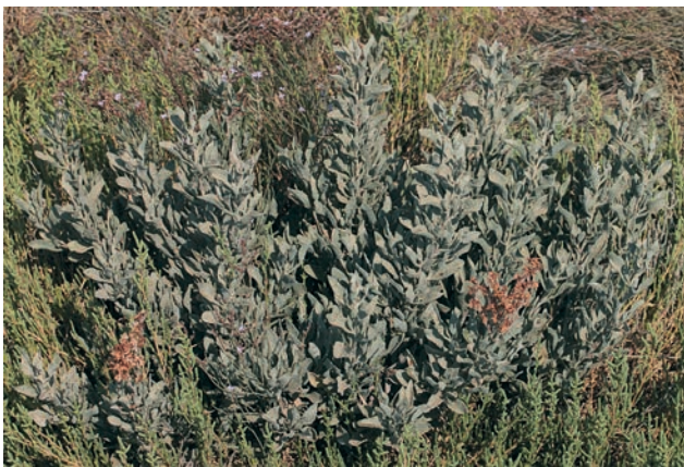
Fig. 10. Limoniastrum monopetalum.

New for the respective eparchies, nomi and phytogeographical regions Peloponnese and Sterea Ellas. At the salines of Legrena, a single plant was in fruit amongst clumps of Arthrocnemum macrostachyum .