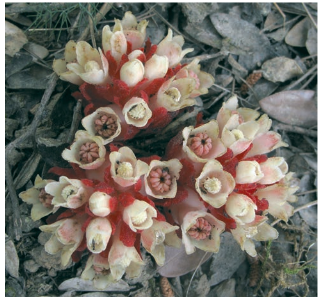
Fig. 11. Cytinus hypocistis subsp. clusii ((photo K. Polymenakos).

New for Mt Imittos, recorded from Mts Pendeli and Parnitha. Parasitic on Cistus creticus and distinguished from C. h. subsp. hypocistis by its creamy-white flowers; in the latter they are yellow.