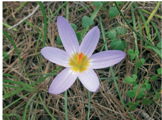
Fig. 19. Crocus sieberi subsp. atticus.

New for eparchia and nomos. Second record for the Peloponnese, the first being from the Methana Peninsula in Nomos Attikis, Eparchia Trizinias.