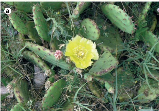
Fig. 15 & 15a. Opuntia humifusa.