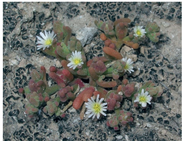
Fig. 6. Mesembryanthemum nodiflorum.

New for eparchia and nomos. With Frankenia spp., Stachys swainsonii subsp. melangavica and Campanula celsii subsp. spathulifolia .