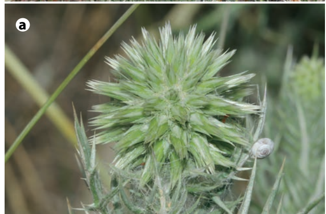
Figs. 16 & 16a. Echinops graecus.