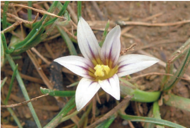
Fig. 20. Romulea columnae.

New for eparchia and nomos. With Anemone pavonina , Barlia robertiana , Muscari commutatum and Ophrys spp.