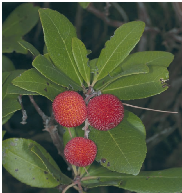
Fig. 8. Arbutus unedo.

Not listed from Pateras by Constantinidis (1997).