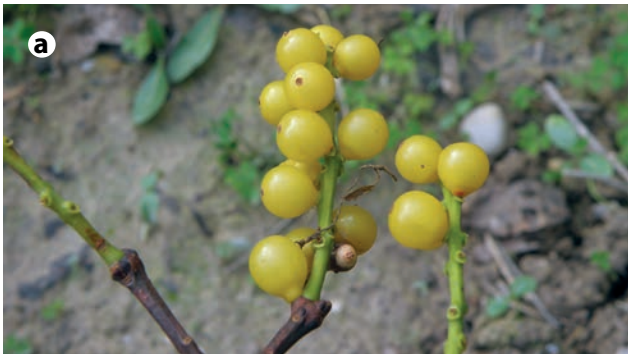
Figs. 17 & 17a. Loranthus europaeus.