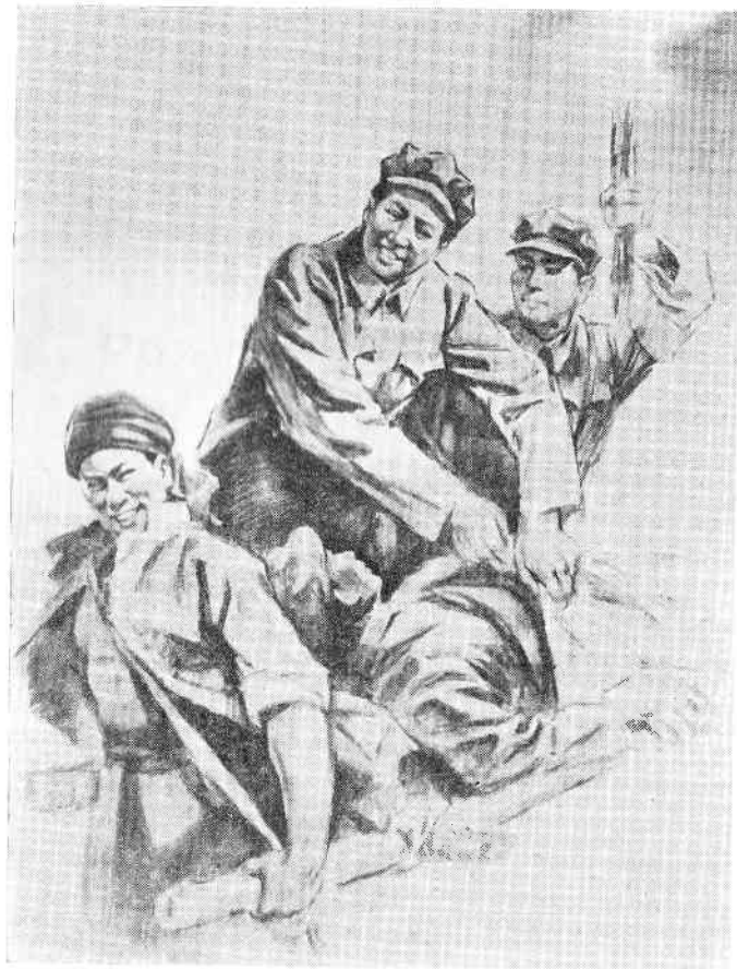
"Is your wound very bad, comrade?" (p.25)

At dawn, crowds of people appeared on the road, surging back and forth. On the walls, on the trees and everywhere in the villages posters announced the news of our victory: "Our troops have captured Kupi and Hsintien!" and "Celebrate our first great victory!"