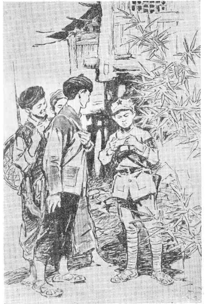
"Yes, yes," a big fellow pulled a small piece of paper out of his pocket. (p.34)

"Yes, yes," a big fellow pulled a small piece of paper out of his pocket.