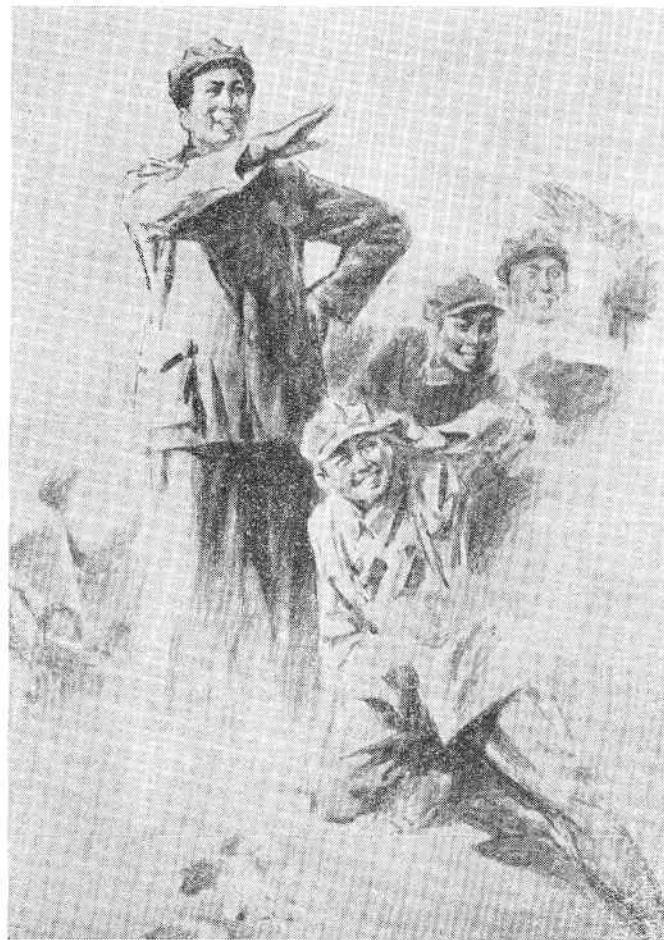
Finally we gained the summit of the mountain pass. (p.69)

Not long afterwards, we met comrades of the Fourth Front Army carrying banners with the words: "Expand the revolutionary base in northwestern Szechuan!" We