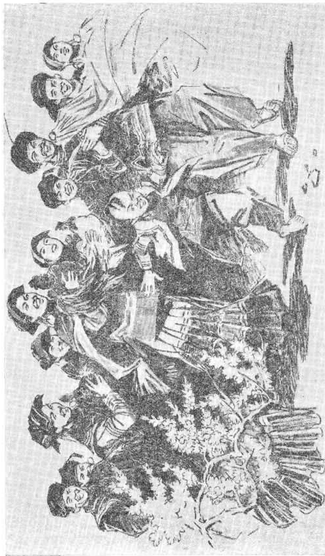
They approached Chairman Mao and surrounded him. (p.52)