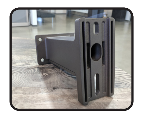
6" Extruded Arm Mount