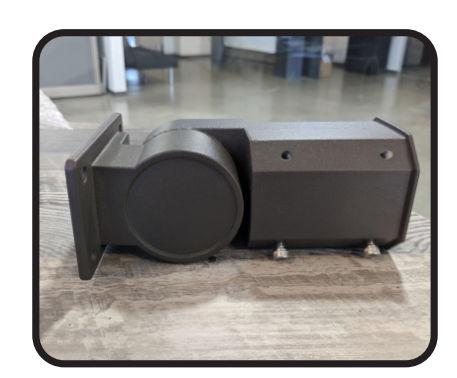
Slip Fitter Mount