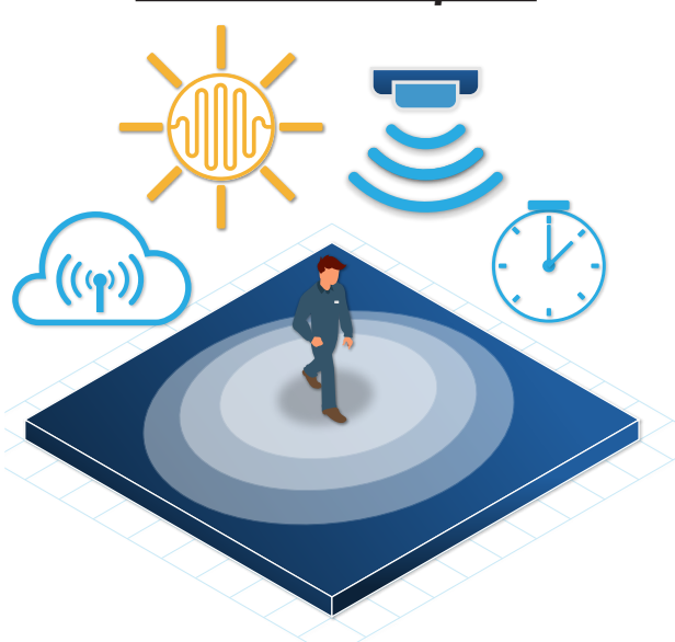
Compatible with controls and integrations