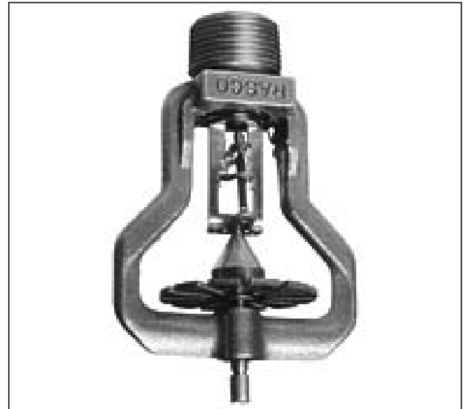
Model H ESFR Sprinkler

The deflector and frame provide a broad, very symmetrical, hemispherical pattern capable of suppressing fires between sprinklers in high storage height areas and at the same time retaining a high momentum central core to penetrate and suppress fires occurring directly beneath the sprinkler in low storage height areas.