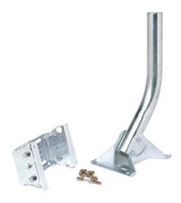
Table 9. Cisco Aironet 1400 Series Bridge Accessory Features