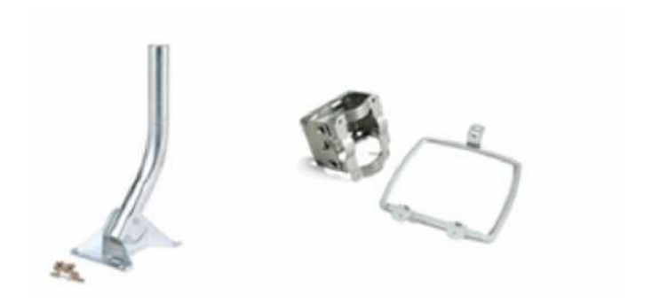
Figure 6. Cisco Aironet 1300 Series Mounting Hardware

In addition to the antennas available from Cisco, the Cisco 1300 Series has different mounting options (Figure 6). These optional mounting kits are available for mounting to a roof, wall, or pole. The quick-hang mounting bracket allows a simple one-person installation.