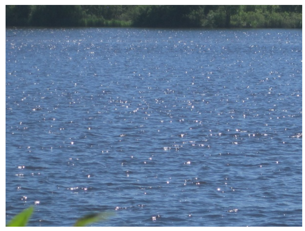
Figure 6: Light of the morning sun sparkling on the Mississippi as seen from my backyard. 5 June, 2017, 11:39 a.m. .

– in feeling these physically in my body, I feel, too, in the emotional sense of the word. ^{\rm 24}