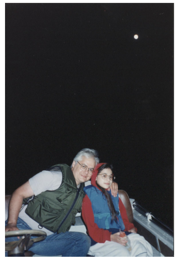
Figure 10: My dad and me boating on the Mississippi River at night. Summer 1996?

The idea of connecting to other times via sky observation also came up in another way during this research. When I observed the sky at night from the end of the dock (Fig. 11 - photograph taken during the day, since those I took at night did not turn out well]) at my grandma's house, the sky was quite dark, many faint stars were easily visible, and the Milky Way stretched as a gigantic arch above me, from Sagittarius on the southern horizon, through Cygnus overhead, to Cassiopeia in the north. As I laid on my back at the end of the long