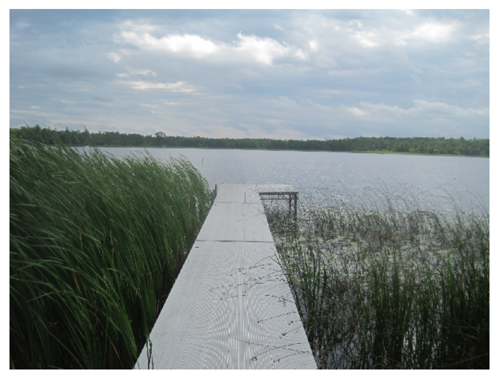
Figure 11: My grandma's dock on the lake. 25 July, 2017, 10:21 a.m.