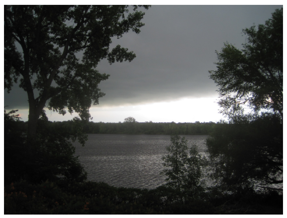
Figure 2: An approaching storm in my backyard on the Mississippi River. 9 July, 2017, 8:47 p.m. .