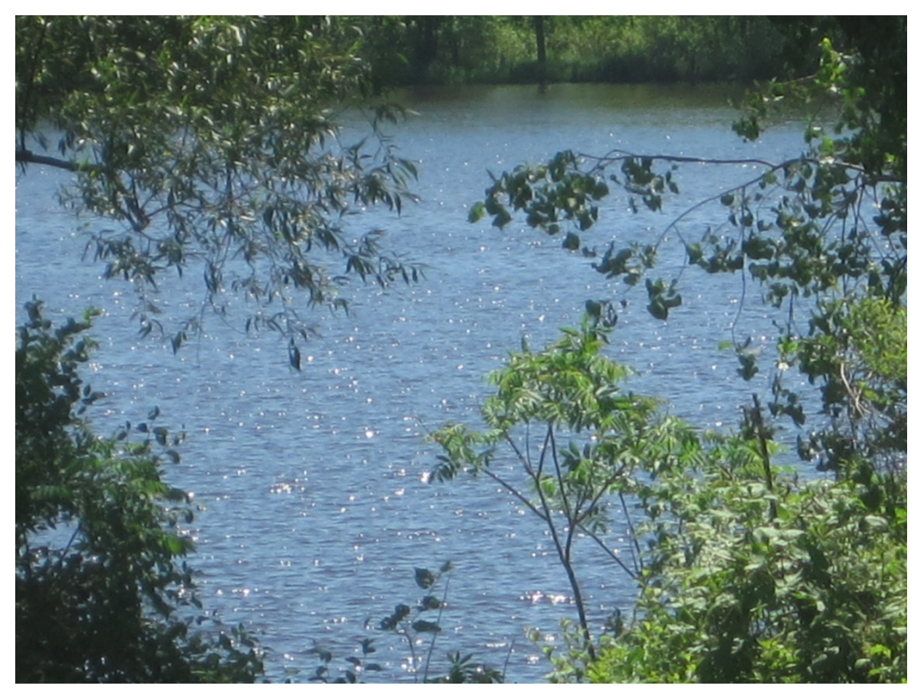
Figure 7: Light of the morning sun sparkling on the Mississippi with trees in the foreground, as seen from my backyard. 5 June, 2017, 11:50 a.m. .