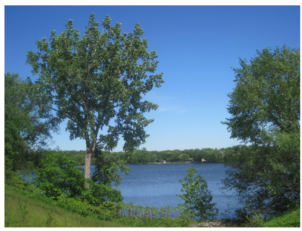
Figure 1: A sunny day in my backyard on the Mississippi River. 31 May, 2017, 3:31 p.m.