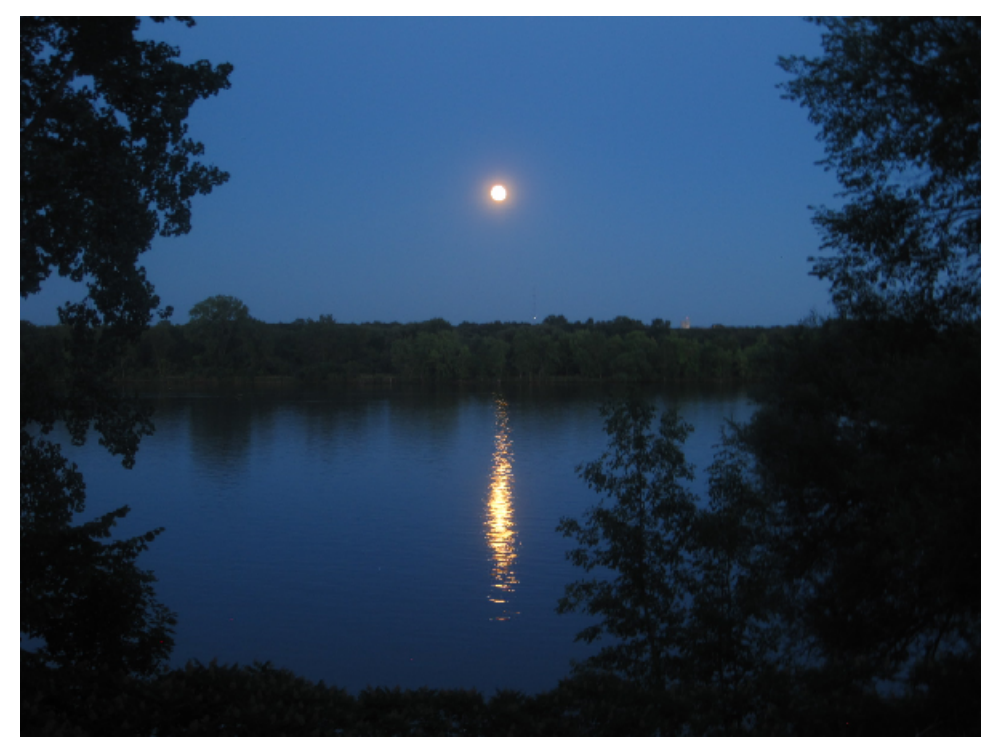
Figure 3: The rising moon from my backyard on the Mississippi River. 8 July, 2017, 9:30 p.m. .