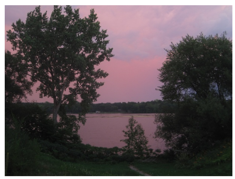
Figure 5: The colors of sunset: facing east in my backyard on the Mississippi River. 1 August, 2017, 8:50 p.m. .

As beautiful as all these scenes are, the one that I found myself writing about with the most excitement was the sight of the light of the morning sun, once it has gained sufficient elevation, bouncing off the gently flowing water. As I wrote on the morning of 5 June, 'The light sparkling on the water is so beautiful, so magical... One cannot begin the day in a better way (Figs. 6 & 7).' Thoreau too, makes note of the play of light upon the water, noting, 'White Pond and Walden are great crystals on the surface of the earth, Lakes of Light.' To me, the light of the rising sun or moon makes the river appear as if it is covered in thousands of sparkling diamonds. This is made possible not only by the light of the celestial body, but also by the combination of a light breeze and slight current, which causes the water to move and thus the light to sparkle.