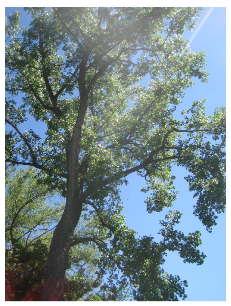
Figure 8: The Cottonwood tree in my backyard. 5 June, 2017, 11:40 a.m. .