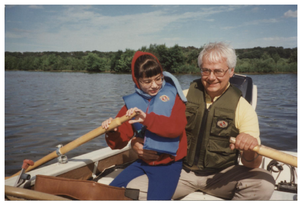
Figure 9: Boating on the Mississippi River with my dad, June 1996.