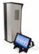
Tablet Management Wall Mount 10