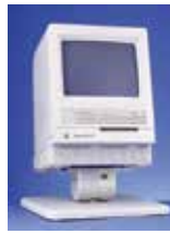
Macintosh™ SE mounted on the Ergotron MacTilt, circa 1987

People who think different can now work different