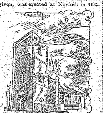
THE OLD CHURCH AS IT IS TO-DAY. The date of its erection was cut into the hard, old bricks at two different points...

THE use of "Castoria" is so universal and its merits so well known that it seems a work of supererogation to endorse it. Few are the intelligent families who do not keep Castoria within easy reach.