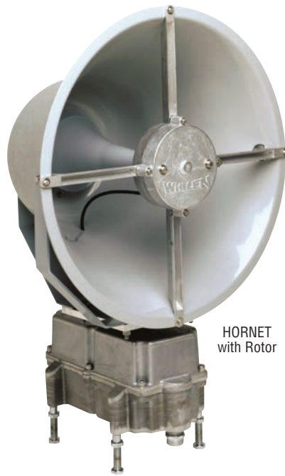
HORNET with Rotor