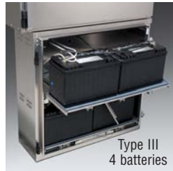
Type III 4 batteries