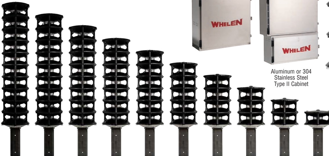
WPS2910 WPS2909 WPS2908 WPS2907 WPS2906 WPS2905 WPS2904 WPS2903 WPS2902 WPS2901