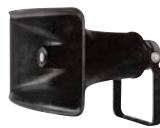
WS60T / WS100