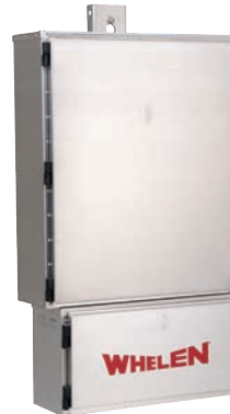
Aluminum or 304 Stainless Steel Type II Cabinet