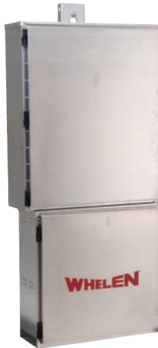
Aluminum or 304 Stainless Steel Type III Cabinet