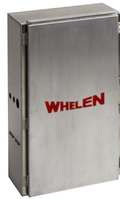
Type I cabinet

IPS400 - IPS800 In-Plant Personnel Warning Systems, include Aluminum Type I Control Cabinet, IPS Four 100 Watt Output Power Amplifier, ESC2030 Siren Controller, 5A AC Battery Charger, UPS Style Batteries and RDVM1G Digital Voice Option Board (Supports up to 28 Messages for an Additional Charge) No Additional Charge if Using Existing Customer Messages on File (Customer to Verify and Supply Message List to be Used)