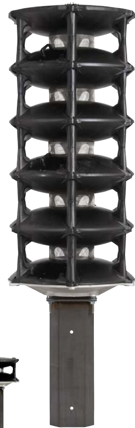
WPS2905 with Pole Top Bracket