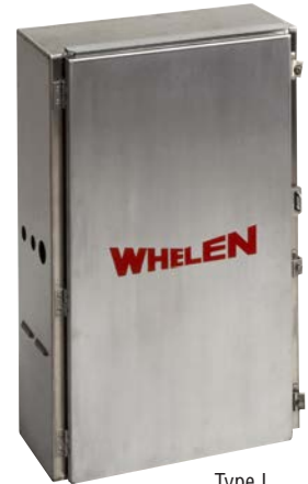
Type I cabinet