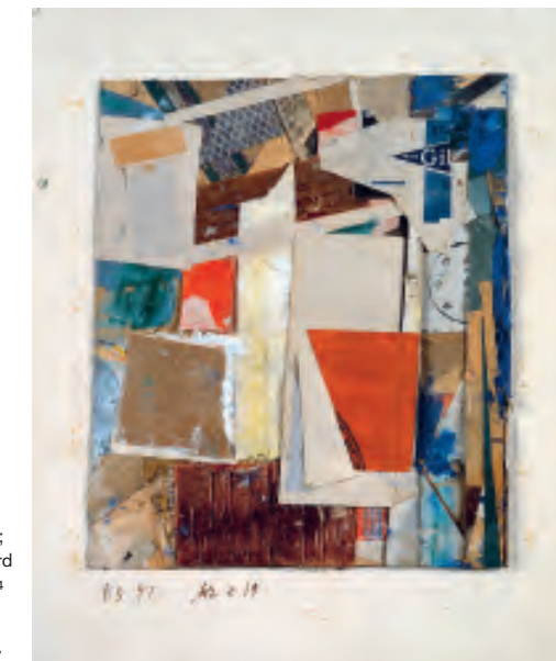
Mz x 19 , 1947. Collage; oil, paper, and cardboard on cardboard, 6⅛ x 5¼ inches. Collection of Ellsworth Kelly.

"In the sculpture he produced in the 1940s, with their rough, brightly colored surfaces, [Schwitters] finally resolved the competition between object and surface that had occupied him as an artist all his life. Here paint and material are one." 4