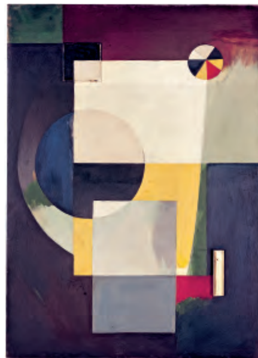
Verschobene Flächen (Shifted Planes) , ca. 1923. Oil, glass, and wood on board, 27 x 19½ inches. Collection Albright-Knox Art Gallery, Buffalo, New York, George B. & Jenny R. Matthews and Edmund Hayes Funds, 1975.

Cardboard, printed paper, and scraps of cloth overlap painted areas in several layers and define new geometrical shapes that Schwitters, in turn, reworked with opaque or transparent pigment in such a way [as] to construct a densely interwoven conglomerate. By employing such painterly techniques as complementary and light-dark contrasts, Schwitters produced a dynamic, rotating picture structure; radiating outward are sharp-pointed triangle shapes, their colors equally indebted to the found materials and their overpainting. 2