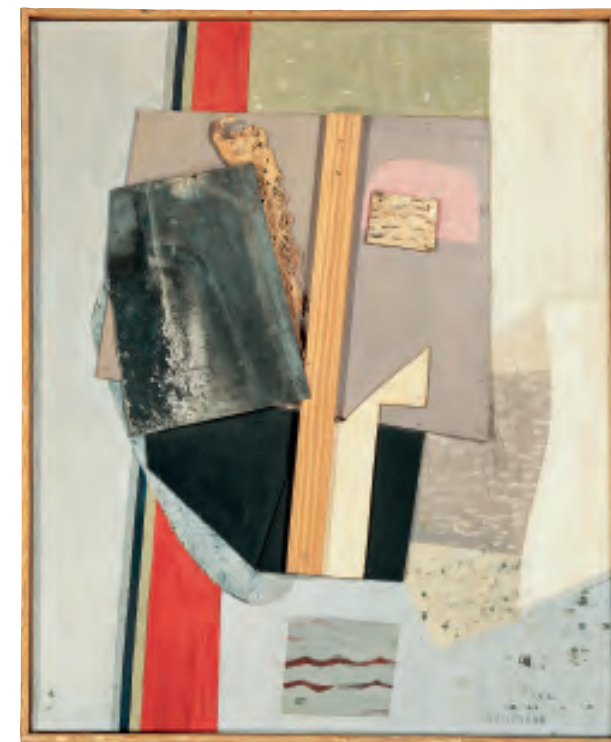
Körtingbild (Körting Picture) , 1932. Assemblage; oil, wood, bark, metal, and seaweed nailed to canvas, 29 x 23⅞ inches. Private Collection

When the Nazis invaded Norway in 1940, Schwitters once again took flight, this time to England. He stayed in London for a short time before moving on to the rural Ambleside, where he spent the last years of his life. While in England, Schwitters continued to make collages but also began creating small plaster sculptures, such as Untitled (The All-Embracing Sculpture) , ca. 1942–45, and Untitled (Togetherness) , ca. 1945–47. These modest works can perhaps be best understood in the context of Schwitters's greater Merz project. Schulz observes,