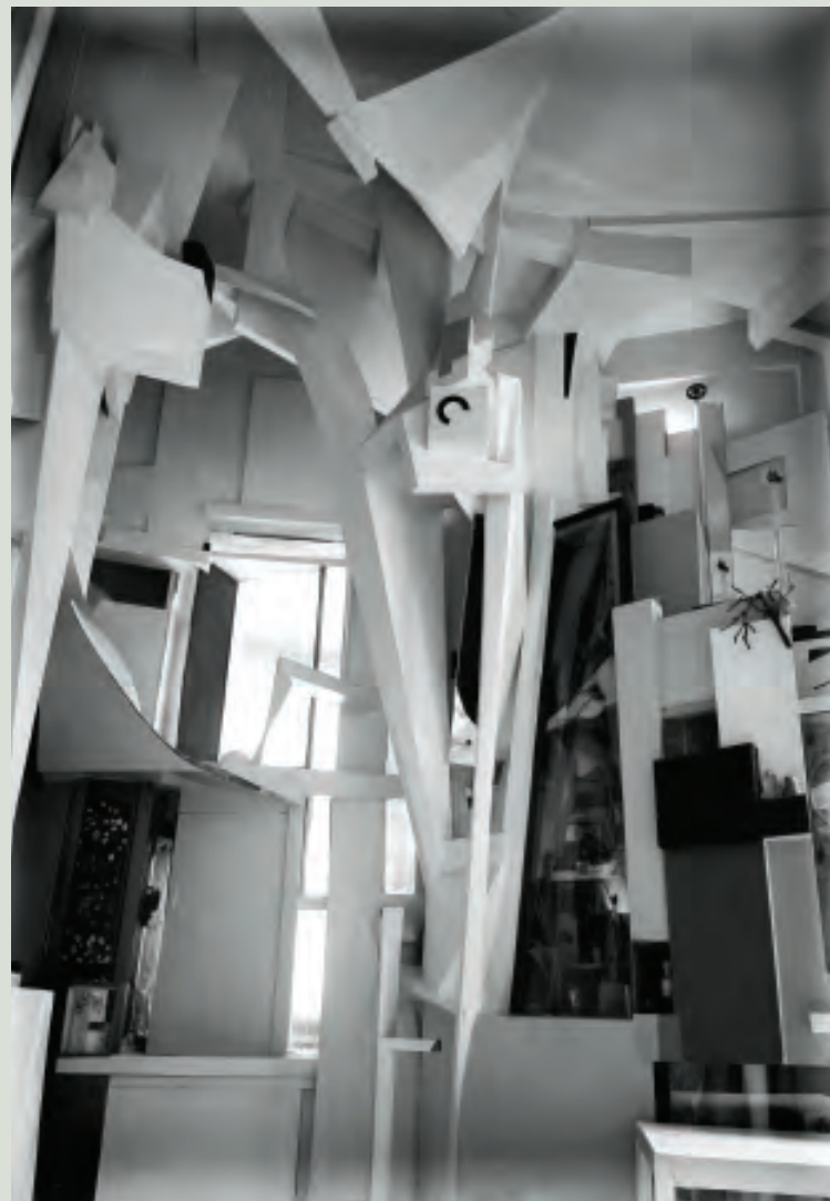
Hanover Merzbau , "Blue Window," 1933 (destroyed 1943). Kurt Schwitters Archive at the Sprengel Museum Hannover. Photo: Wilhelm Redemann

Unfortunately, in October 1943 Allied air raids destroyed the Hanover Merzbau , the most complete incarnation of the project, along with the entire Schwitters house. However, beginning in 1980, through careful analysis of archival photographs of the space, set designer Peter Bissegger reconstructed the central portion. Despite minor differences between the original and replica, the latter succeeds in conveying the spatial experience of Schwitters's walk-through sculpture. The Menil Collection is pleased to present this reconstruction to United States audiences for the first time.