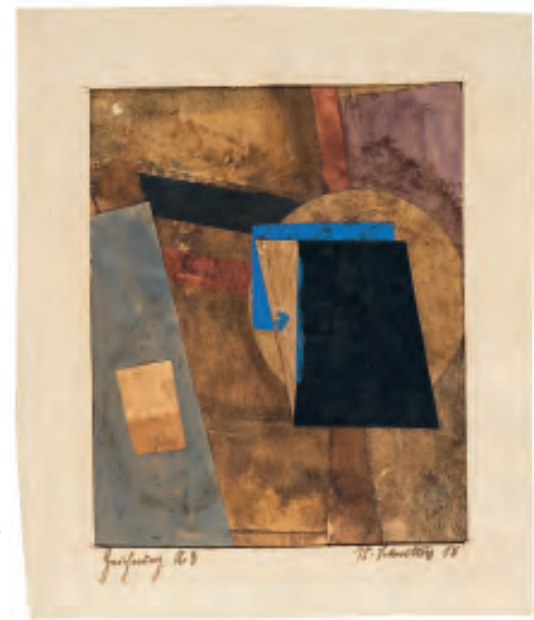
Zeichnung A 3 (Drawing A 3), 1918. Collage; paper on paper, 5¼ x 4¼ inches. Sprengel Museum Hannover, loan from Kurt und Ernst Schwitters Stiftung.

ship of painting to collage in Schwitters's oeuvre from the conception of Merz until the end of his life.